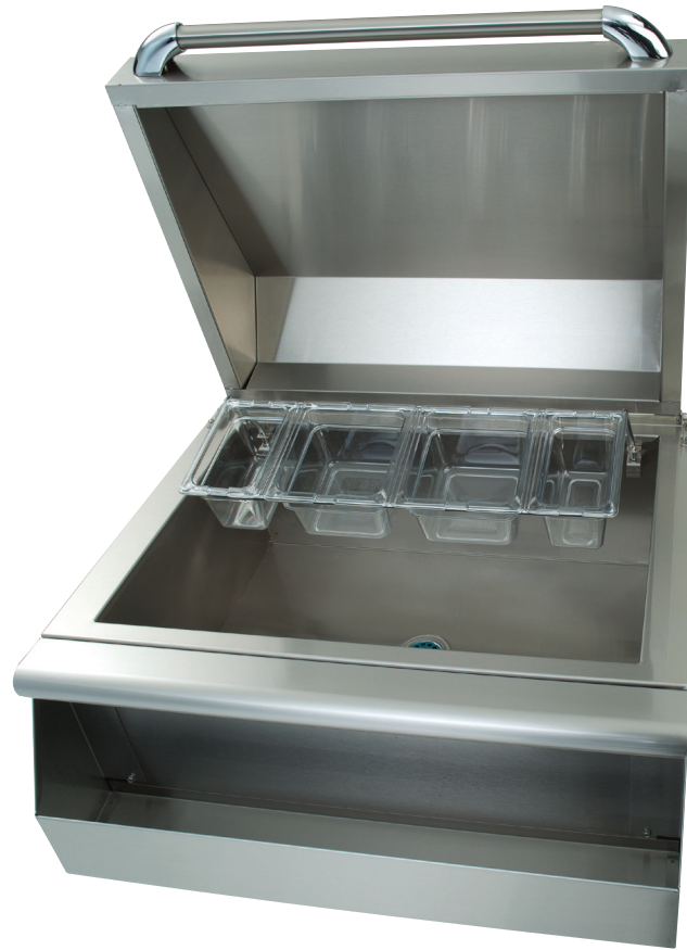
26CLRBI (shown w/ PSQ26CLRFRT)