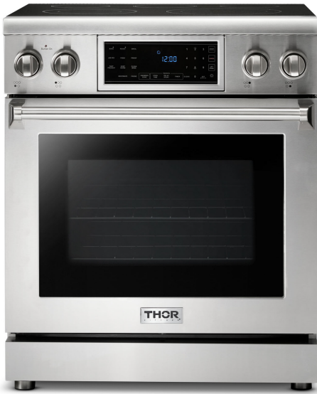
Product: 30 Inch Tilt Panel Professional Electric Range Model Number: TRE3001