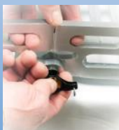
Quick Connect Pins