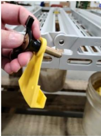
Use Quick Connect Pins to divide ramp into shorter sections.