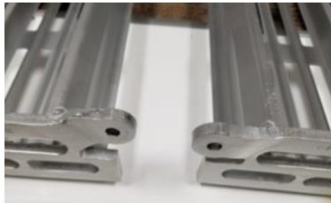
Quick-Connect Pins can replace any bolt in a Roll-A-Ramp