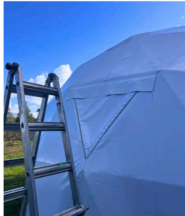
Window Prep & Clean