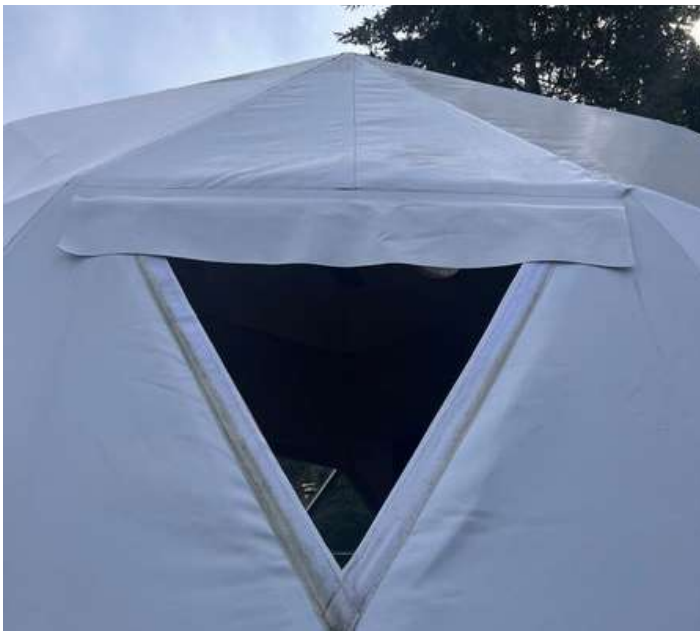
Remove Old Window - Photo 1

To help clean the PVC surface we recommend using warm soap and water.