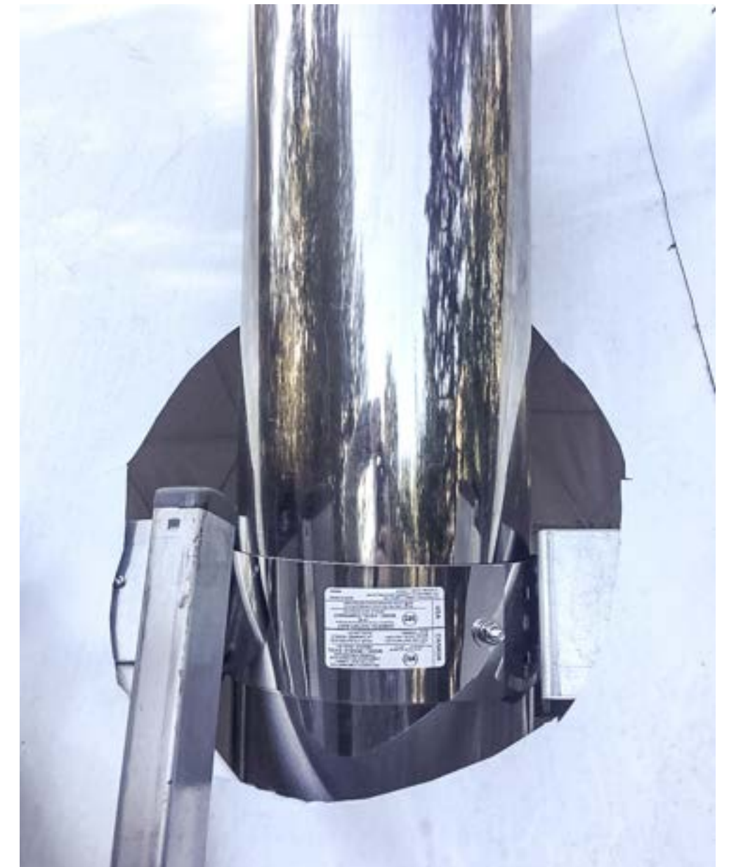
Example shown includes 3rd party chrome chimney support (unnecessary in most cases)