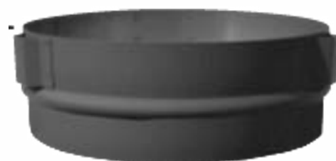
6" Stove Collar Adaptor

-6" double wall - stove (top) collar adaptor - ICC Part #BE6UBSE