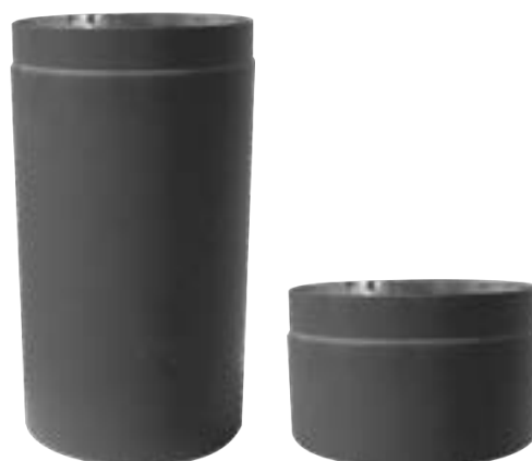
6" Double Wall adjustable length