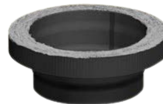
6" Flute Extension BI6EX