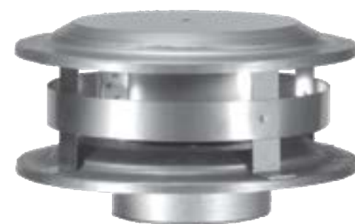
6" Rain Cap