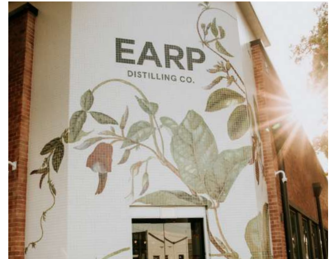
WHOLE VENUE HIRE CEREMONY + RECEPTION AT EARP DISTILLERY

All prices shown are indicative, final fees to be agreed upon booking. Prices shown are inclusive of GST. events@earpdistillingco.com