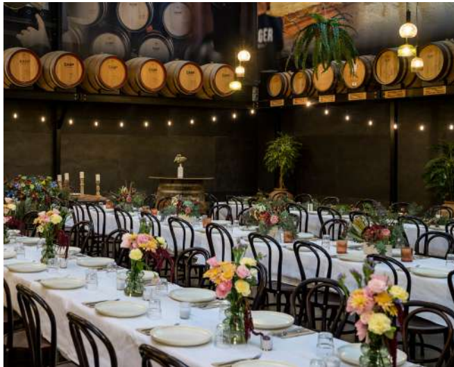
RECEPTION THE BARREL HALL AT EARP DISTILLERY