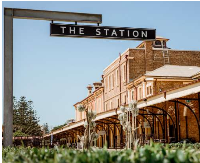
OFF SITE CEREMONY THE STATION AT NEWCASTLE FORESHORE