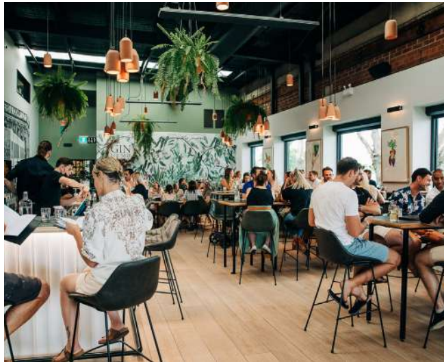
DISTILLERY BAR PAX: 10 - 30