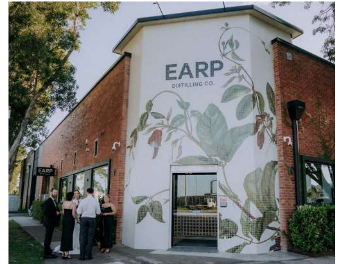
WHOLE VENUE HIRE

All prices shown are indicative, final fees to be agreed upon booking. Prices shown are inclusive of GST. events@earpdistillingco.com