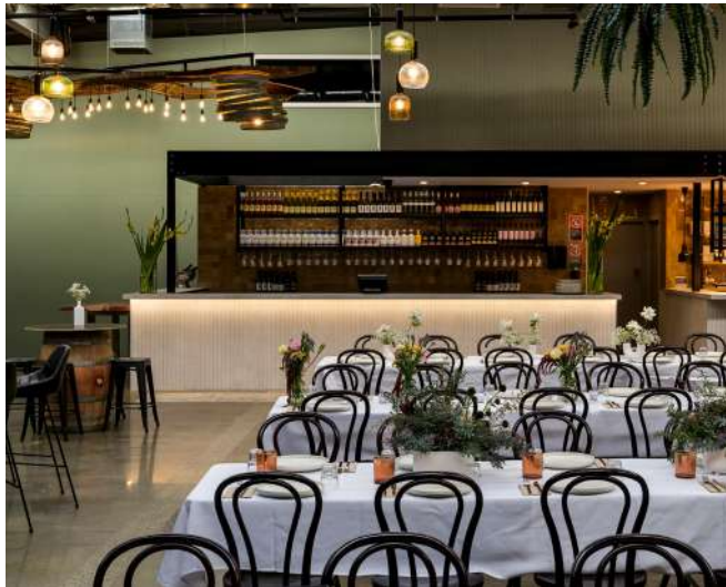
BARREL HALL PAX: 30 - 300