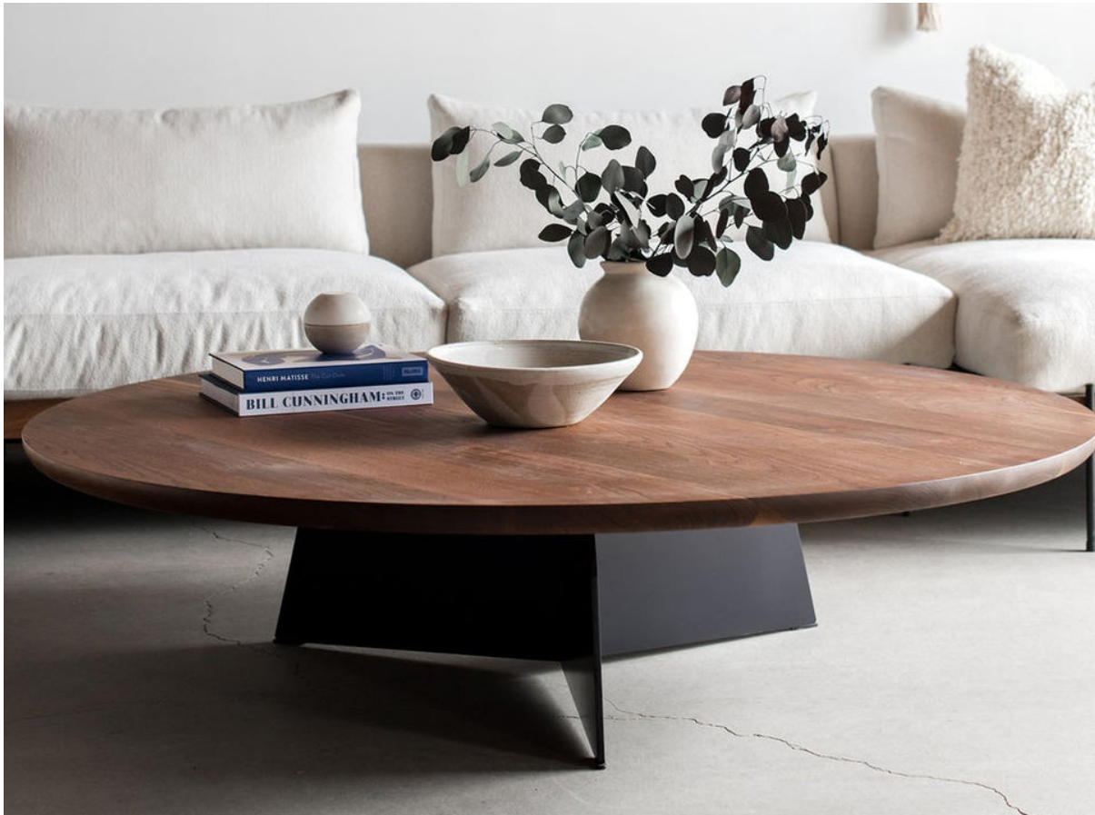
SHOWN IN OILED WALNUT + BLACK POWDER COATED BASE + PAIRED WITH RIVERA SOFA SECTIONAL