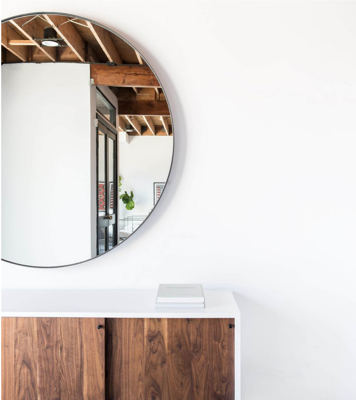
SHOWN IN 48" DIA PAIRED WITH OUR RIVERA CREDENZA