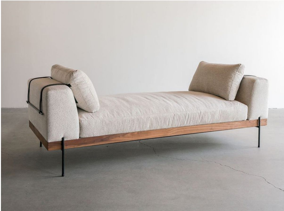
SHOWN IN SAND