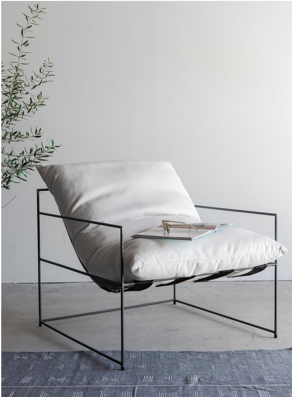
SHOWN IN STANDARD WIDTH + LOW ARMS IN SEA SALT