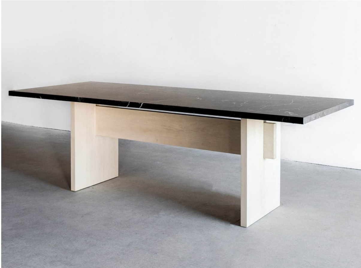
SHOWN IN NERO MARQUINA MARBLE + BLEACHED MAPLE BASE

DINING TABLE 96”L + 36”W + 30”H 590LBS 108”L + 36”W + 30”H 700LBS