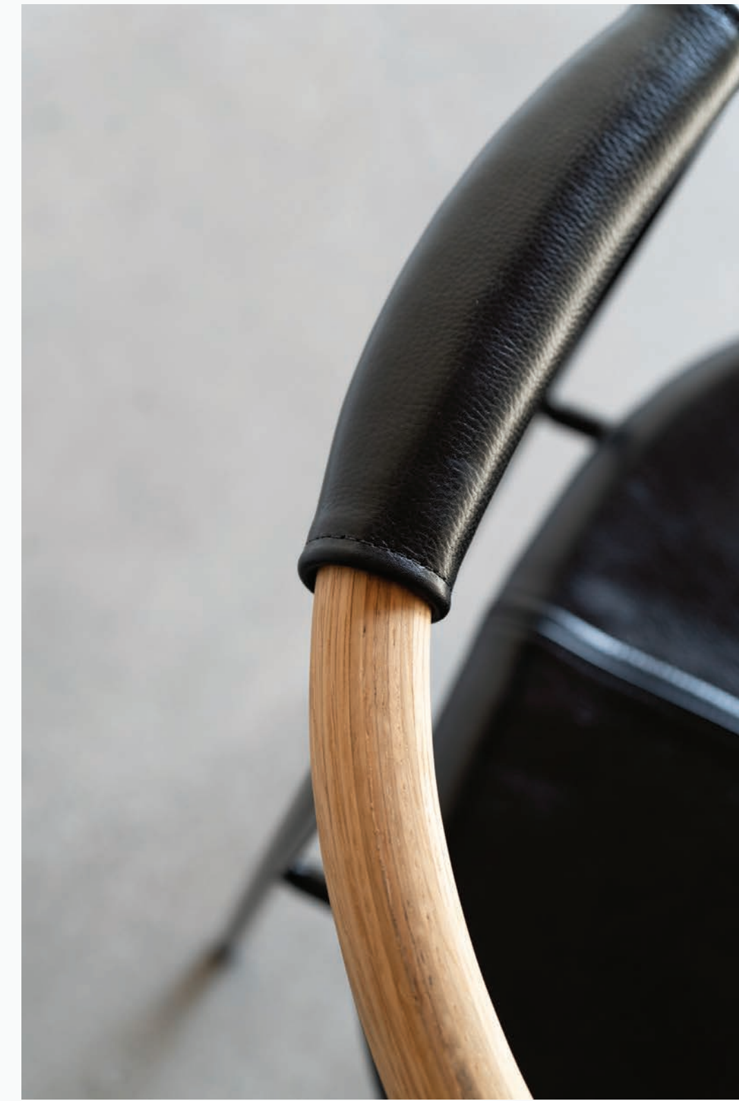
hand wrapped leather detail