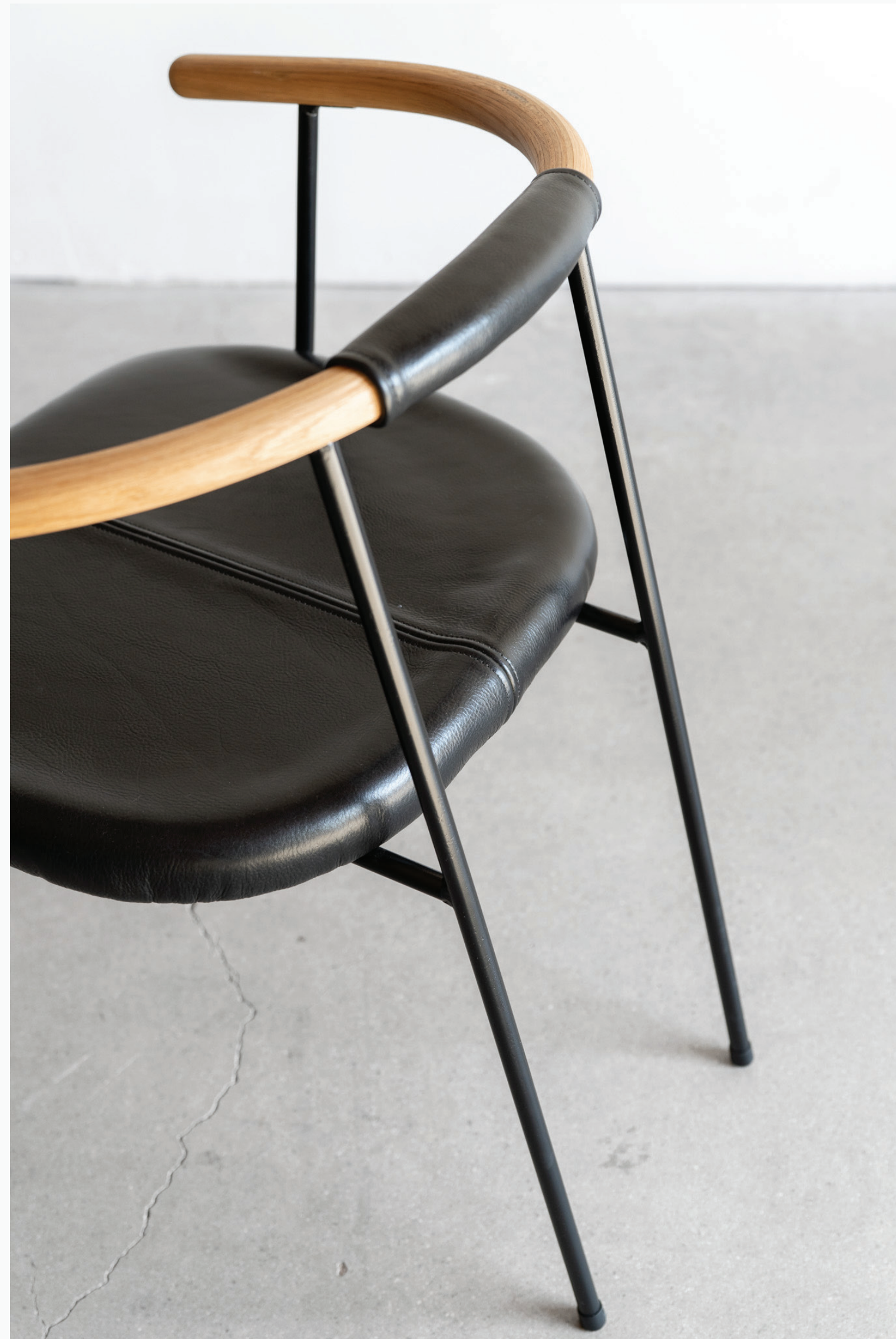
shown in rodeo black leather