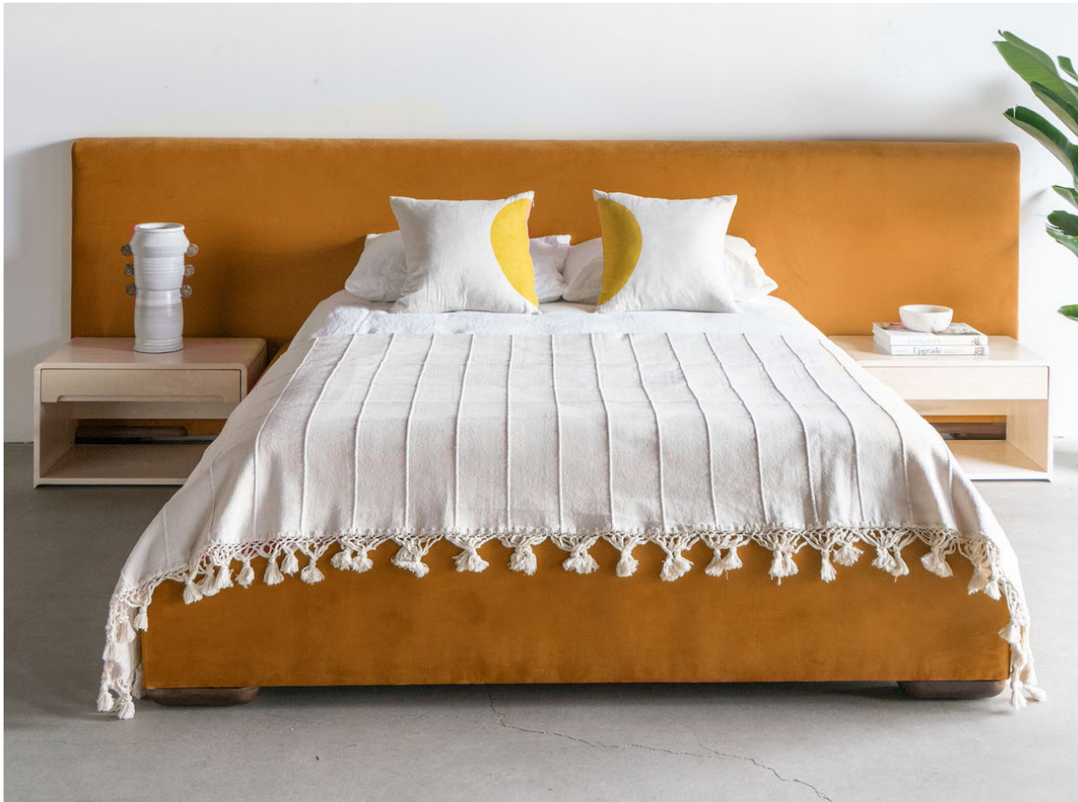
SHOWN IN BUTTERSCOTCH VELVET