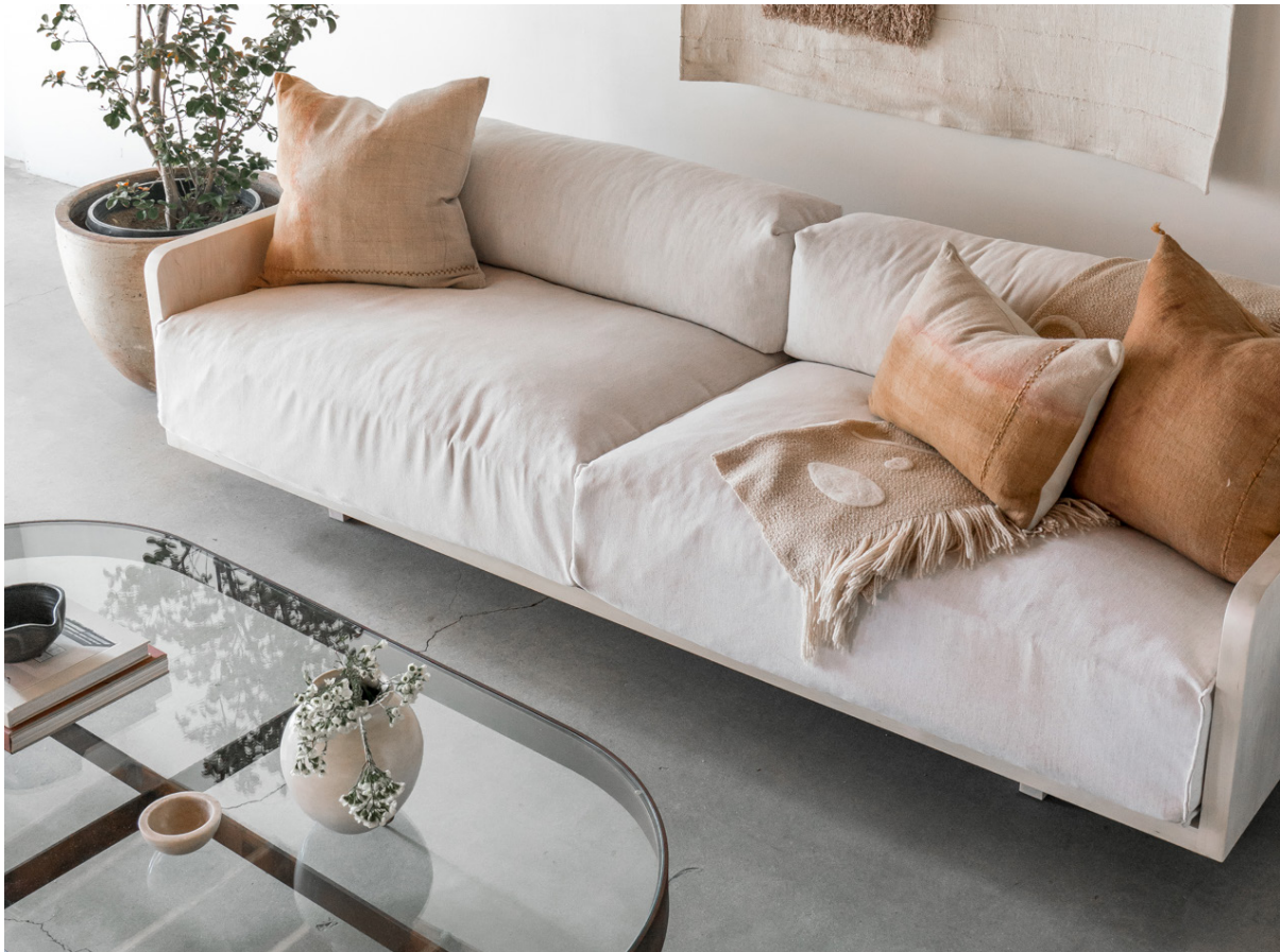
SHOWN IN 96"W IN SNOW PAIRED WITH PALMAS COFFEE TABLE (OVL)