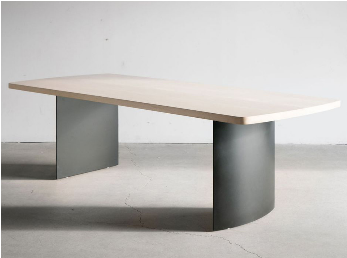
SHOWN IN BLEACHED MAPLE, MATTE POLY