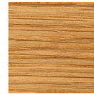
OAK, PURE MONOCOAT

for more information or finishes please contact our design team at info@crofthouse.com