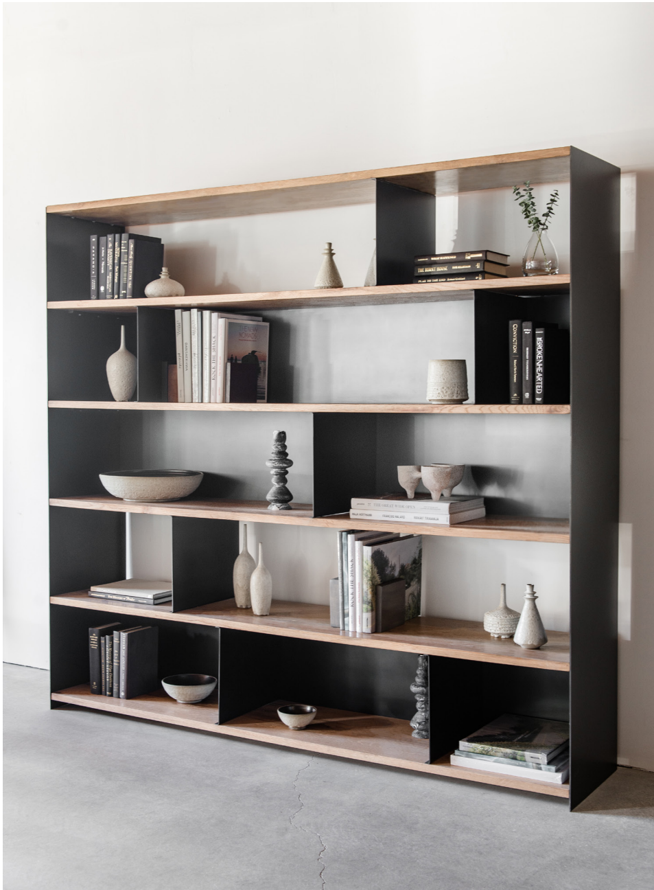
SHOWN IN OAK, PURE MONOCOAT