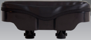
PART 1 SEAT