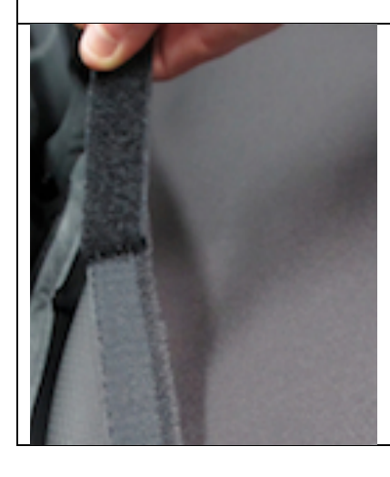
Step 17) If happy with the fitment in Step 15 and Step 16, lift the cushion section up and remove the protective touch tape. Affix the velcro to the carpet on the cushion section, as per the photos to the left and on the next page.