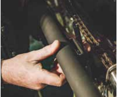
A) Loosely install pipes on cylinder heads & rear bracket.

B) Tighten nuts on cylinder heads first, then tighten nuts & bolts on rear bracket.