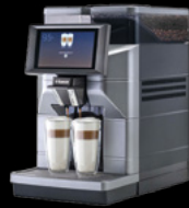
Magic M2 / M2+