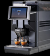
Magic B2 / B2+