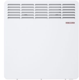
CNS Trend M