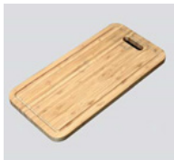
B20.42 chopping board