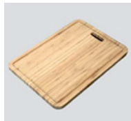
B30.42 chopping board