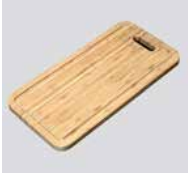
B20.42 chopping board