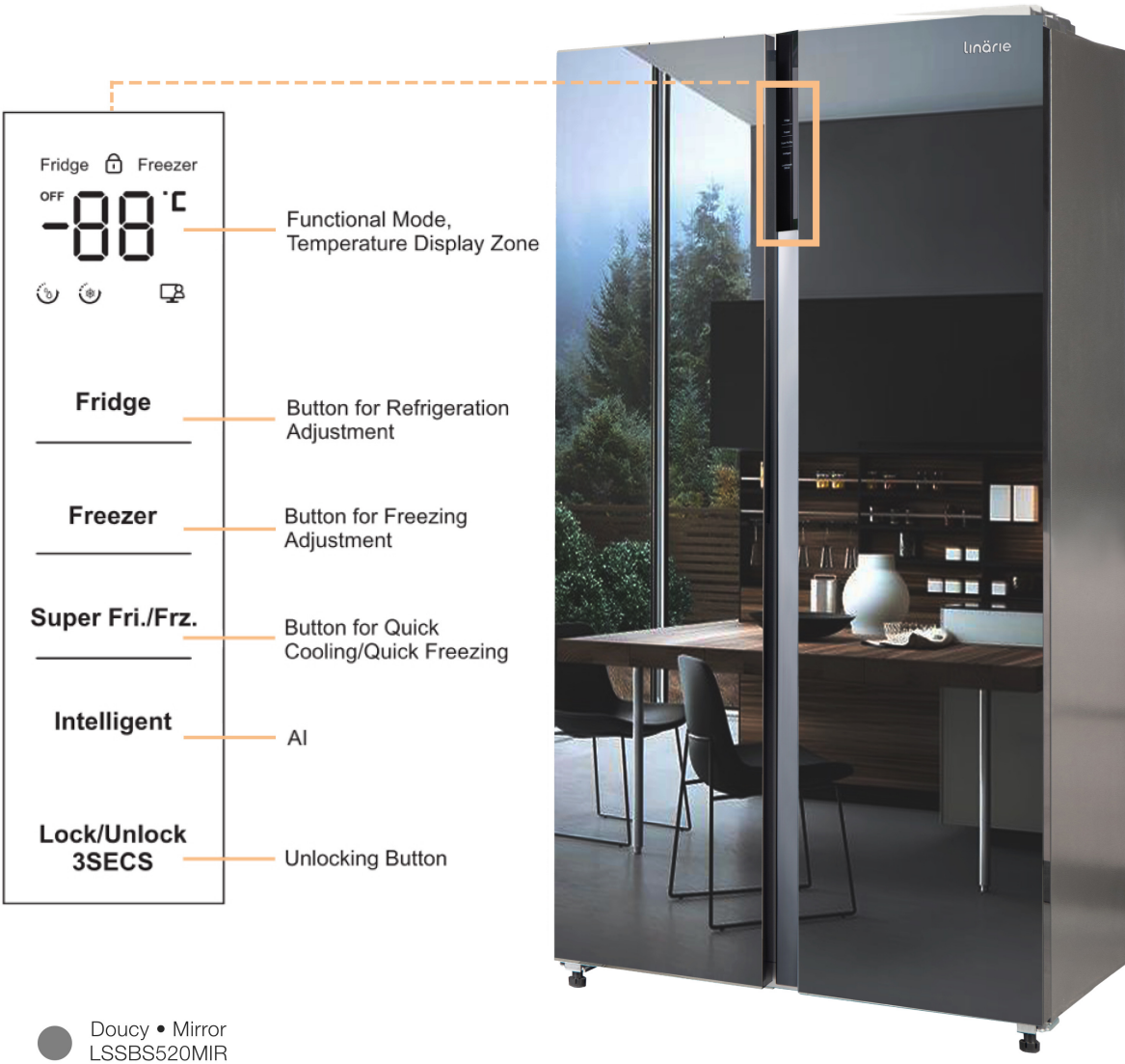
Doucy • Mirror LSSBS520MIR