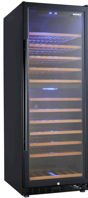
Black Trim Shown