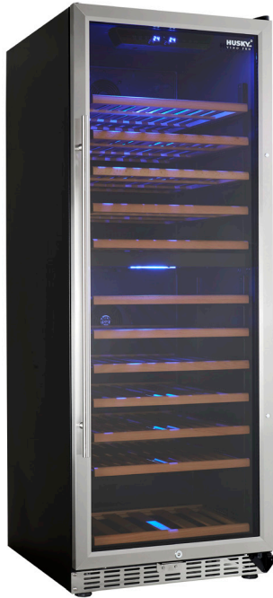
Stainless Steel Trim Shown