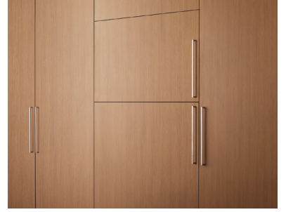
Blends seamlessly behind your cabinetry