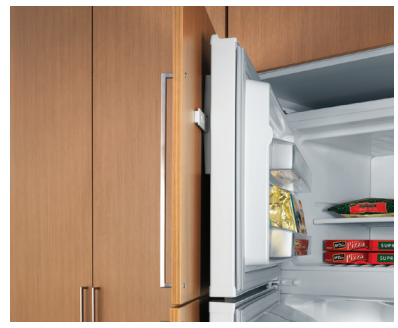
Specialised 120° wide opening hinges