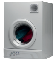
Upside Down Installation