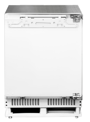
3 star energy rating