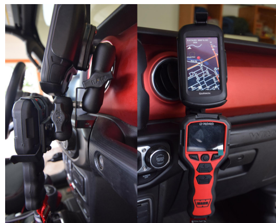
1/4" Ball Mount