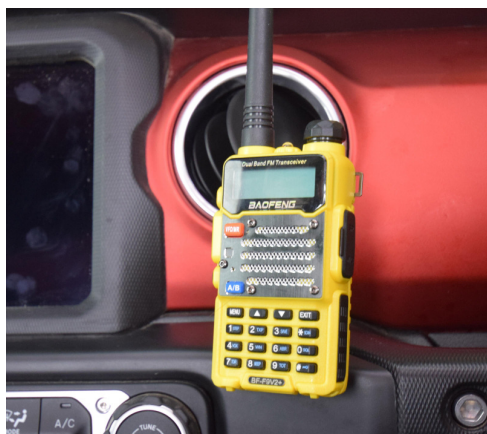
Cut out to fit 2 way radio