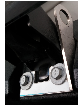
(Hinge Bracket shown un-painted for contrast)