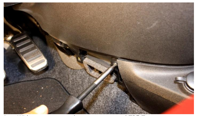
With cover removed, remove exposed T25 Torx screw.