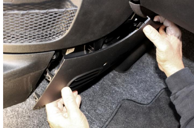
Remove the T25 Torx from passenger side lower cover then