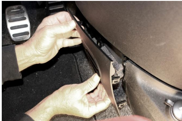
Remove the T25 Torx screw from driver side lower cover then pull off.