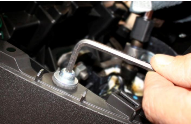
Remove the T25 Torx screw and 5mm Hex Key bolt from each side on the top edge of console.