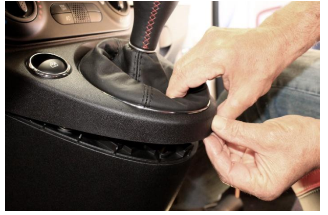
1. Grab the rear of the center console top and lift up to detach.