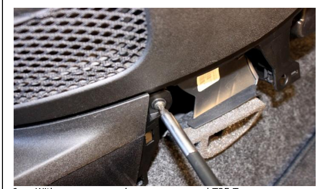
With cover removed, remove exposed T25 Torx screw.