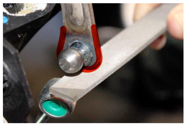
9. Using a metal file, go around the outside edge of the shift lever stamping to remove any burrs or high spots.