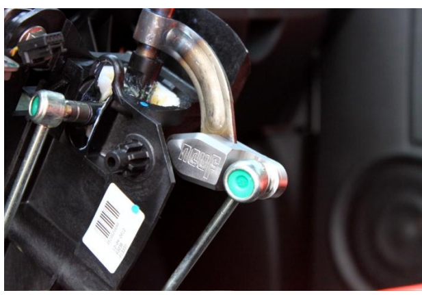
13. Grease ball and push on cable socket end. Check operation of shifting thru gears.

14. Re-install center console in reverse of disassembly. NOTE : Before installing center console, tape over metal clips at bottom of console (step 4 & 6) to prevent scratching of floor console when re-installing. Then remove tape after console is seated properly.