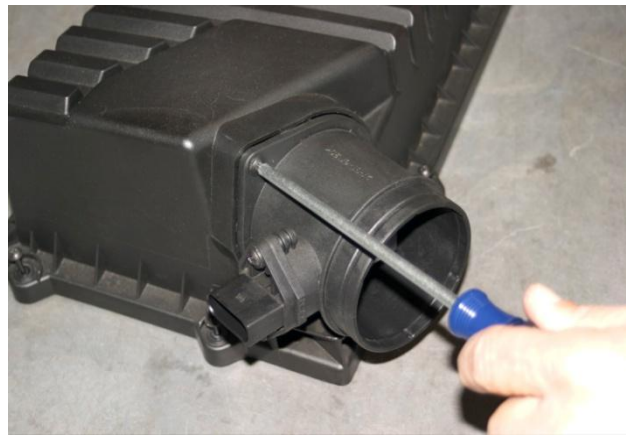
14. Unscrew and pull-out MAF from air box lid.