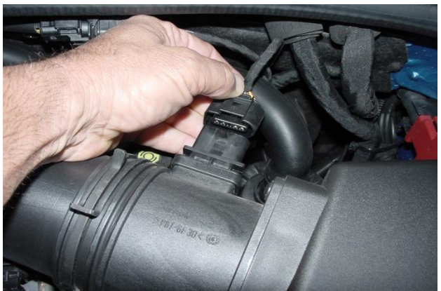
3. Disconnect electrical connector at MAF sensor.