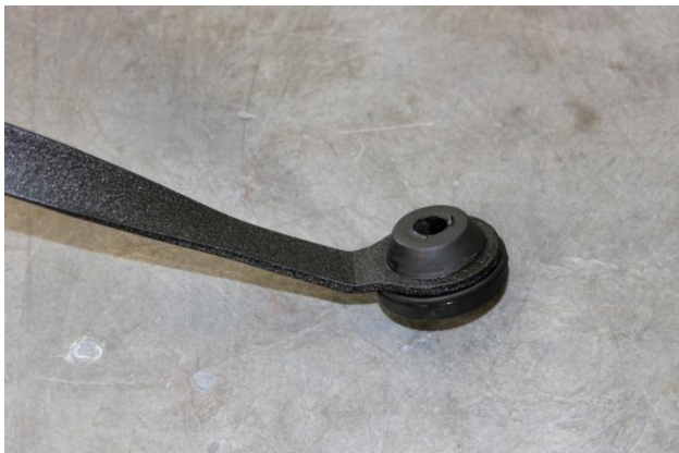
20. Remove rubber grommet from lower air box and install into hole of supplied support bracket – long.