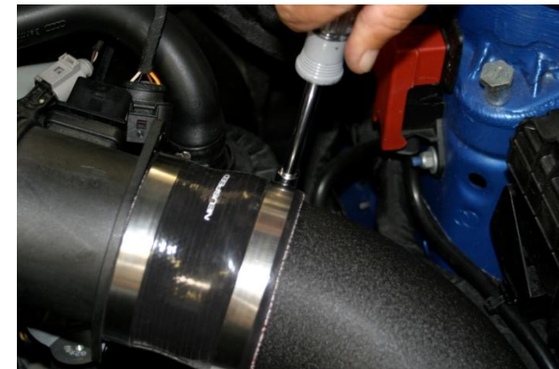
19. Loosely install supplied #56 hose clamp onto silicone hose. Install P-Flo bracket onto mounts while inserting tube into silicone hose. Install and tighten supplied acorn nut to retain P-Flo bracket to isolator. Tighten #56 hose clamp.