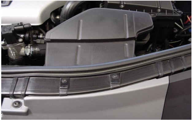
1. Remove air intake duct at radiator support. There are (2) T25 Torx screws on top of support.