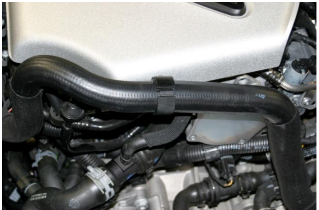
13. Reinstall engine cover and push clamp into hole to lock on.