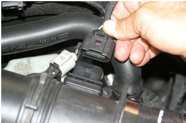
22. Connect electrical connector to the MAF.