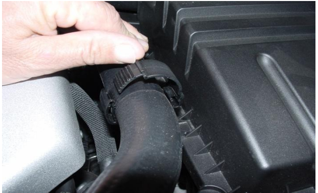
2. Unclip sound amplifier hose attached to air filter box lid.