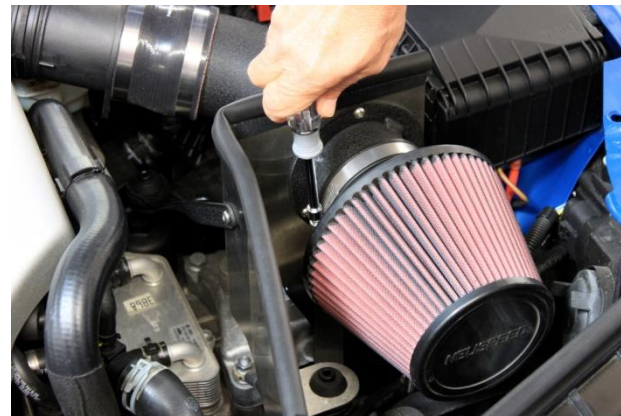
23. Install weather strip on to edge of P-flo bracket, then install NEUSPEED filter.