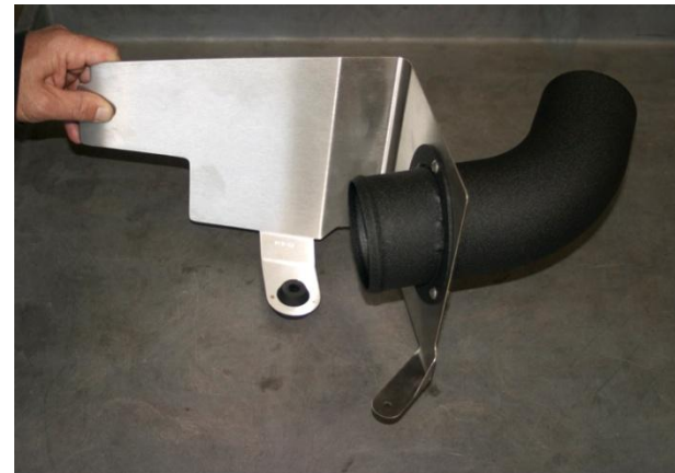
18. Install NEUSPEED intake tube to P-Flo bracket and tighten with supplied M6x12mm button head screws and nyloc nuts.