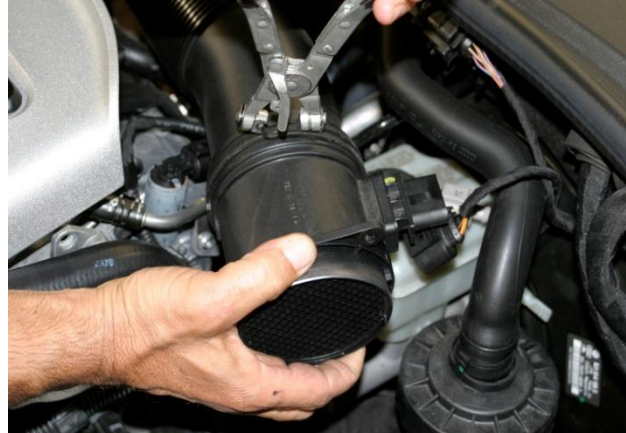
15. Reinstall MAF to factory tube.