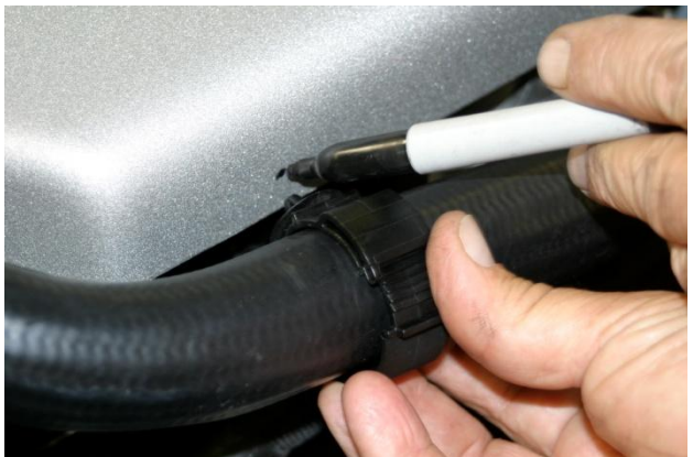
12. Install clamp back onto hose and mark side of engine cover. Remove engine cover off it's rubber mounts by lifting up. Drill a 1/4" hole and deburr both sides of hole.