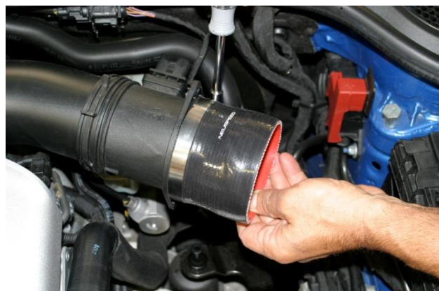
16. Install supplied silicone hose with smaller end onto MAF using supplied #52 clamp.