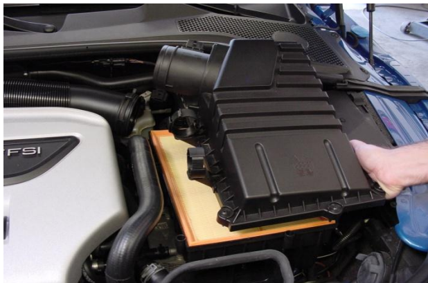
6. Remove air box lid using Phillips screwdriver then air filter.