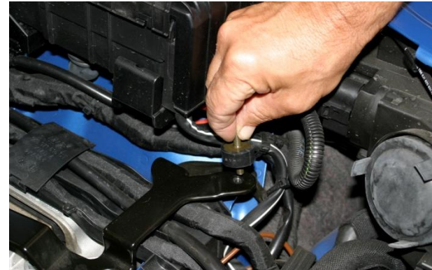
8. Install and tighten supplied rubber isolator onto left front air box mounting bracket.