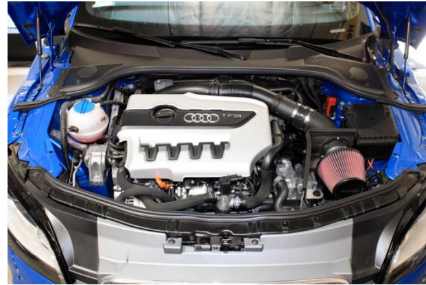
24. Installation is now complete. Double-check tightness of all connections and test drive carefully. NOTE: Double-check all clamps and connections after 1 week of driving.