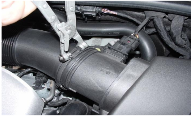
4. Using spring clamp pliers, disconnect air intake tube from MAF sensor.