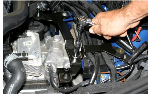
9. Using 10mm socket, temporarily remove the front bolt on air box mounting bracket.