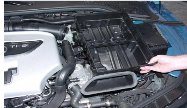
7. Lift off lower air box from the two rubber mounting grommets and remove from vehicle. Use WD-40 or equivalent on grommets to ease removal.