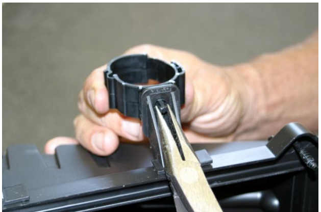
11. Using needle nose pliers squeeze pin to remove one of the sound amplifier hose clamps from air filter box lid.