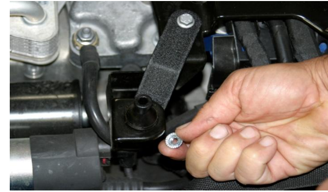
10. Install supplied support bracket to air box mount using original bolt (from step 9), then to stud on underside of mount for rubber grommet using supplied M6 flange nut. Now tighten nut and bolt.