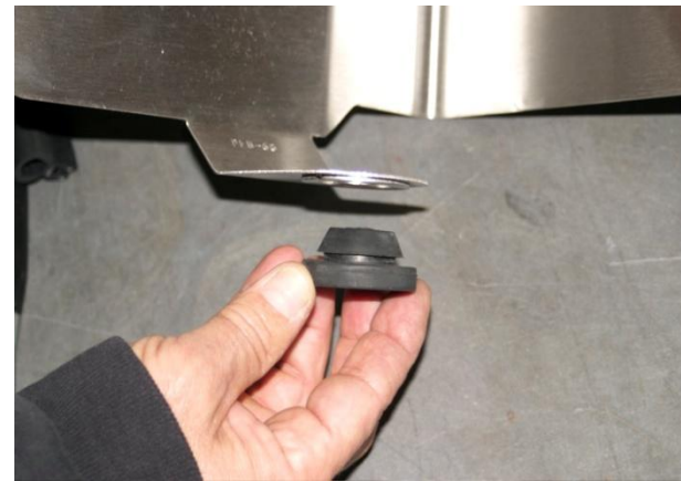
17. Remove rubber grommet from lower air box and install into hole of P-Flo bracket as shown.