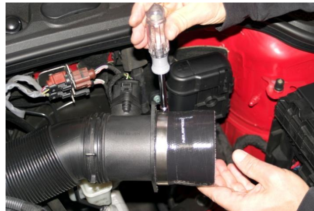
9. Install supplied silicone hose with smaller end onto MAF using supplied #52 clamp.