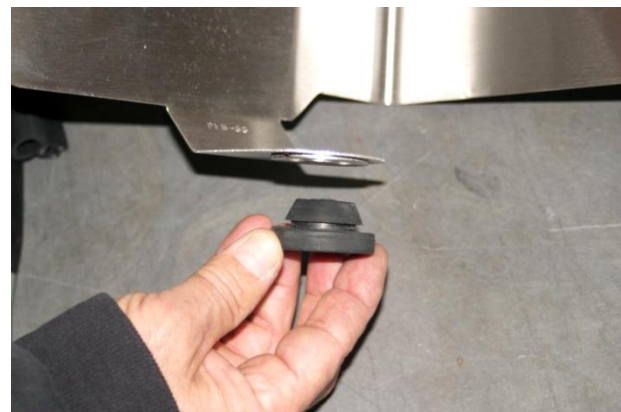
10. Remove rubber grommet from lower air box and install into hole of P-Flo bracket as shown.