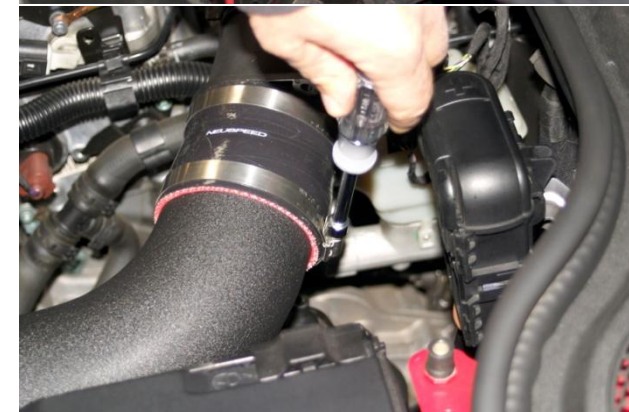
12. Loosely install supplied #56 hose clamp onto silicone hose. Install P-Flo bracket onto mounts while inserting tube into silicone hose. Install and tighten supplied acorn nut to retain P-Flo bracket and isolator. Tighten #56 hose clamp.