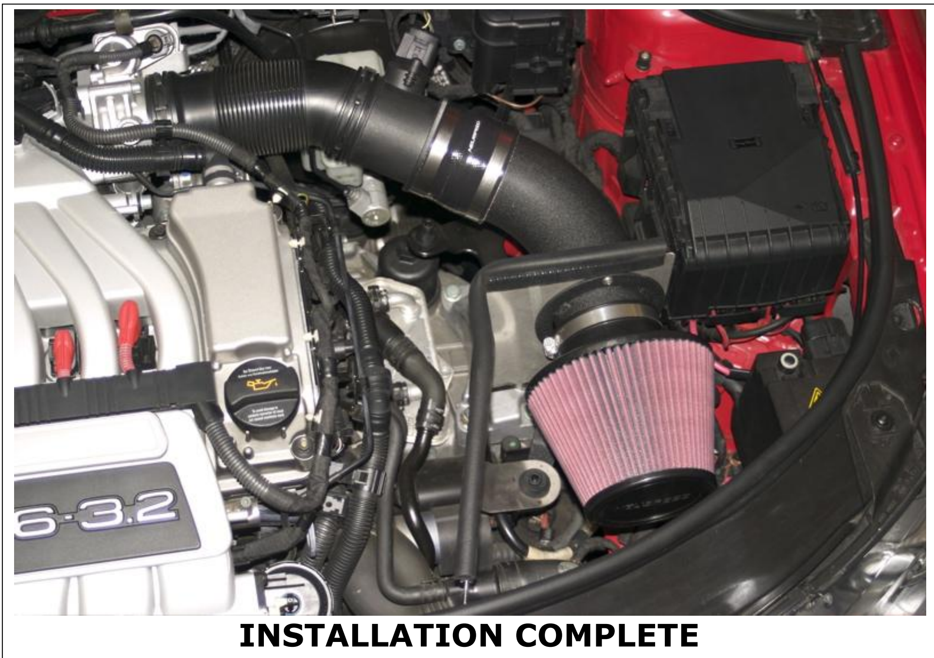
15. Installation is now complete. Double-check tightness of all connections and test drive carefully. NOTE: Double-check all clamps and connections after 50 miles of driving.