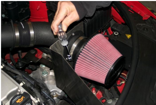
13. Install NEUSPEED filter.