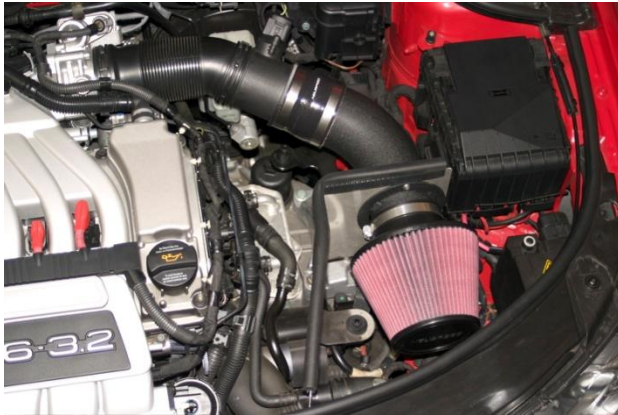
14. Install weather strip seal onto top edge of P-Flo bracket.