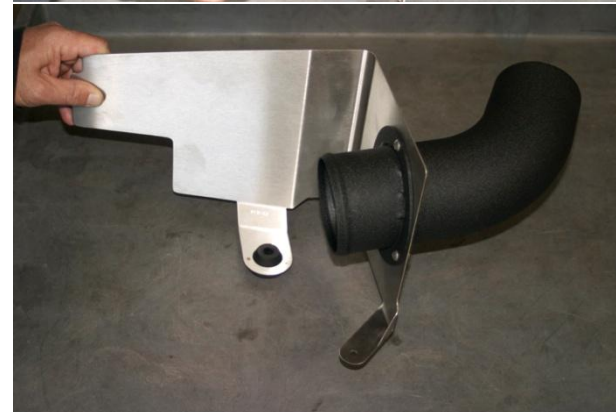
11. Install NEUSPEED intake tube to P-Flo bracket and tighten with supplied M6x12mm button head screws and nyloc nuts.