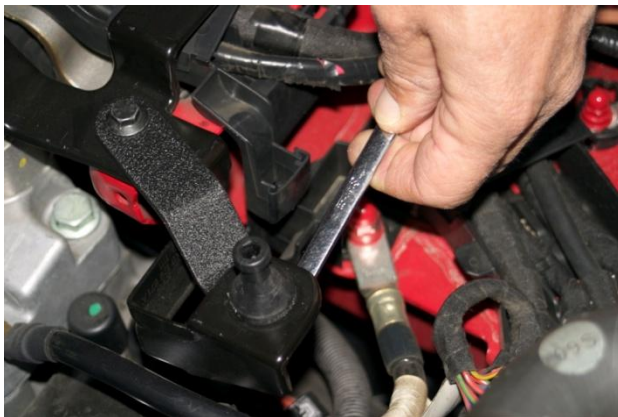
c. Now tighten nut and bolt.