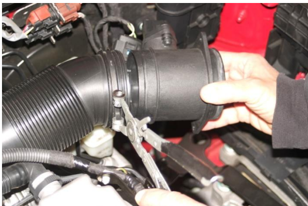
8. Reinstall MAF to factory tube and reconnect electrical connector. NOTE: Make sure there is ample clearance between MAF electrical connector and brake reservoir.