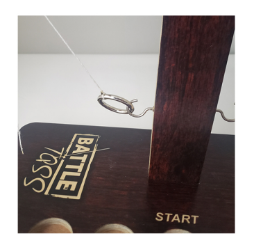
Ring on Hook