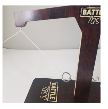
Loop thru eyelet