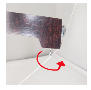
Up to Adjustable rings