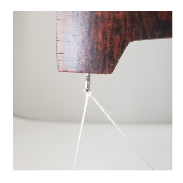
Tie a knot