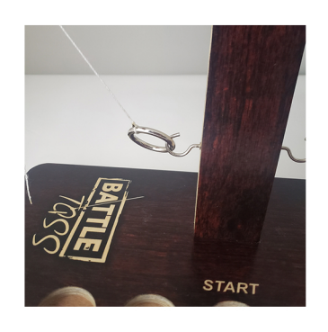
Ring on Hook

Place ring on hook, Loop string thru eyelet from outside to inside making string taunt then up to adjustable rings and wrap aroung making the string tight and secure.