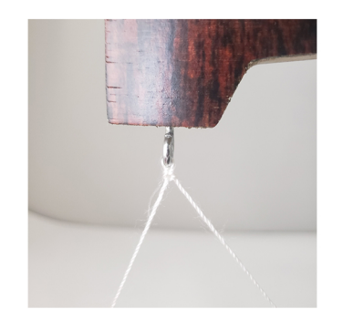
Adjust string taunt and double knot