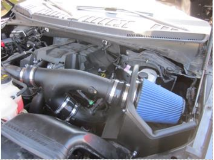
INSTALLED VOLANT APEX 319635 KIT

11.Reattach the negative battery cable and recheck all connections before driving. Retighten all clamps after 500 miles.