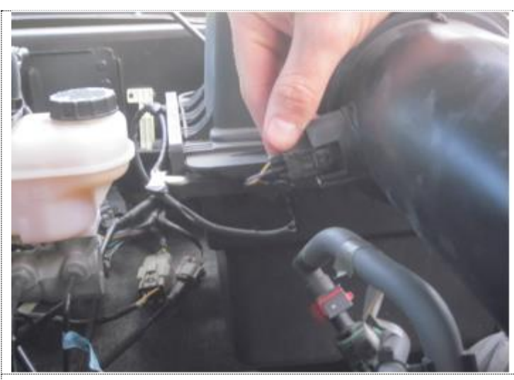
1. Disconnect harness from the air temperature sensor.