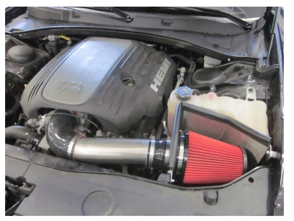
16. Place CARB EO label in visible location under hood. Re-connect battery cable.