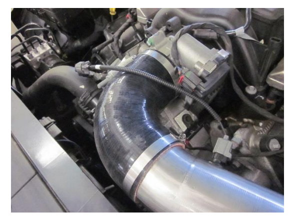
15. Connect wiring harness to ATS.