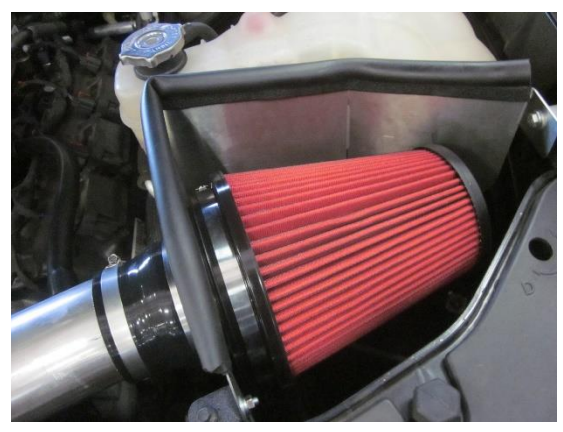
13. Place filter on adapter and tighten clamp using 8mm socket and ratchet.