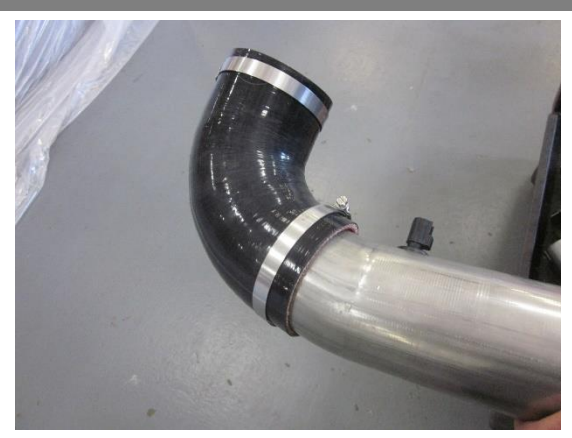
11.Place straight sleeve onto end of Volant duct along with two #60 clamps placed loosely. NOTE: PICTURED ELBOW HAS BEEN REPLACED BY NEW DUCT WITH STRAIGHT SLEEVE.