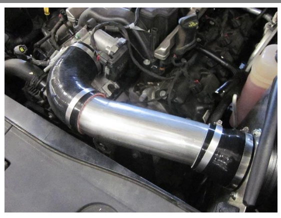
12. Push Volant duct into hump hose and onto throttle body. Adjust duct as necessary and tighten all four clamps using an 8mm socket and ratchet.