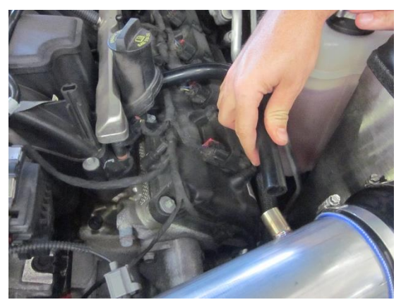
14. Install supplied breather hose onto Volant duct and factory location on engine.