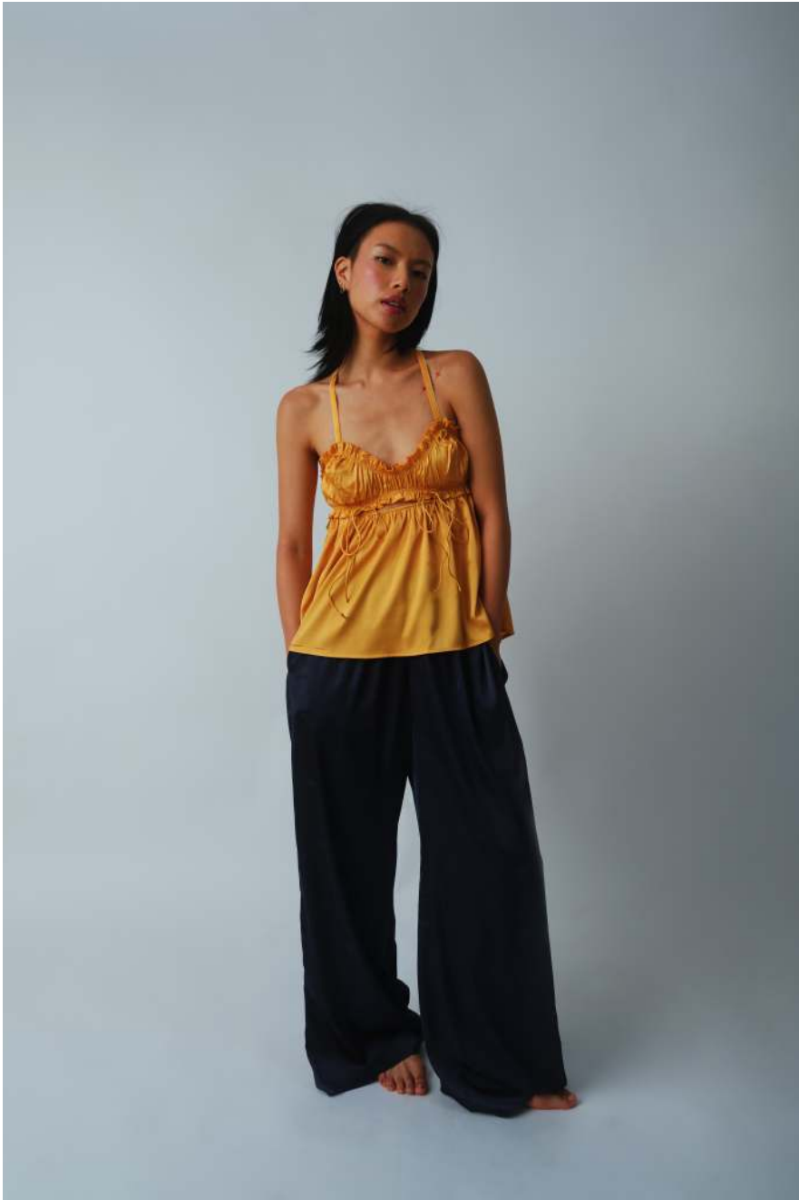
satin bee jacquard bra top with tie detailing and adjustable straps