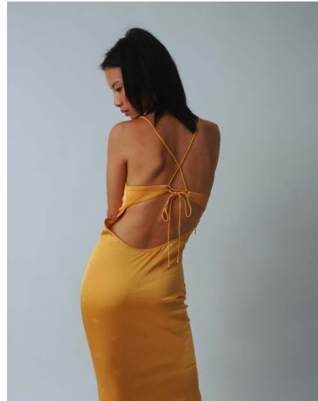
Chase Slip in yolk