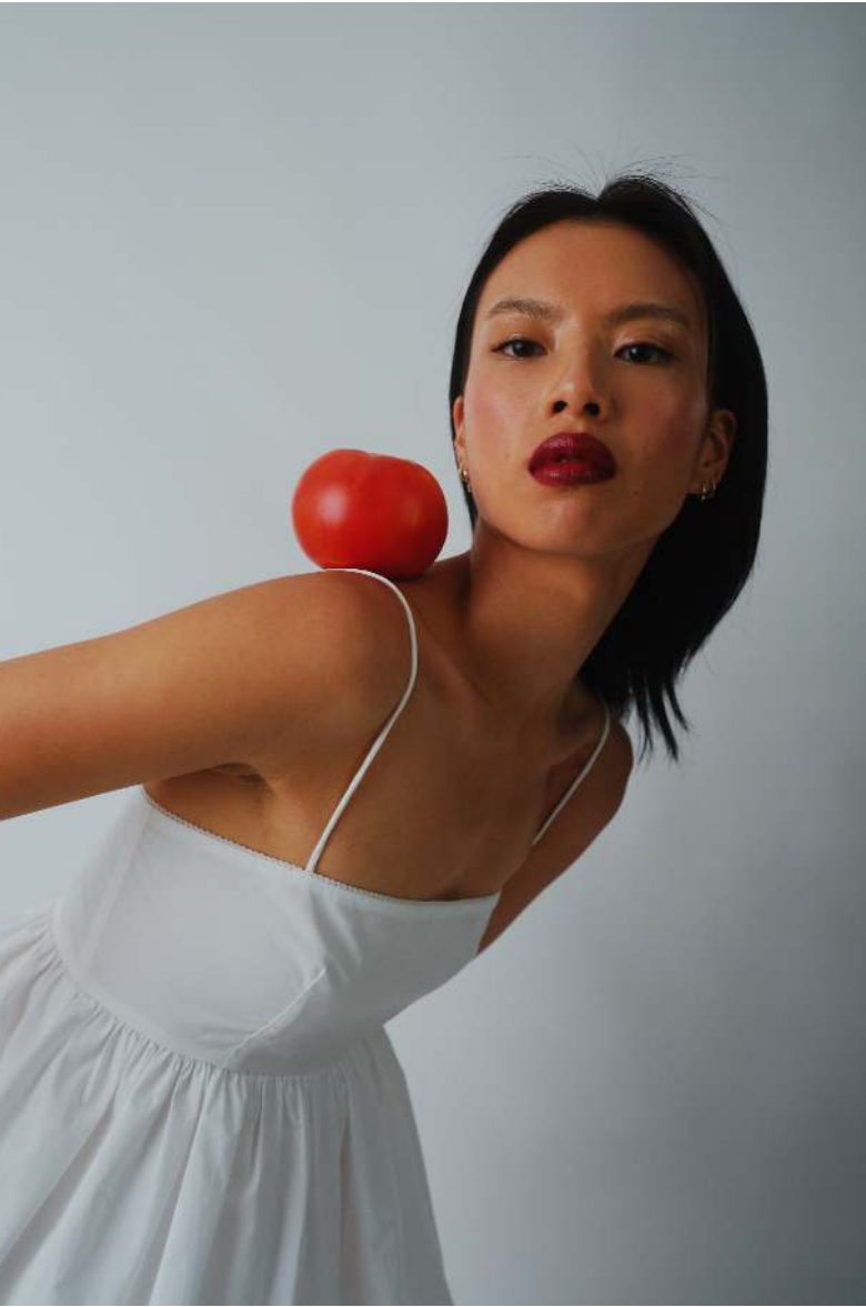
Miso Dress in milk