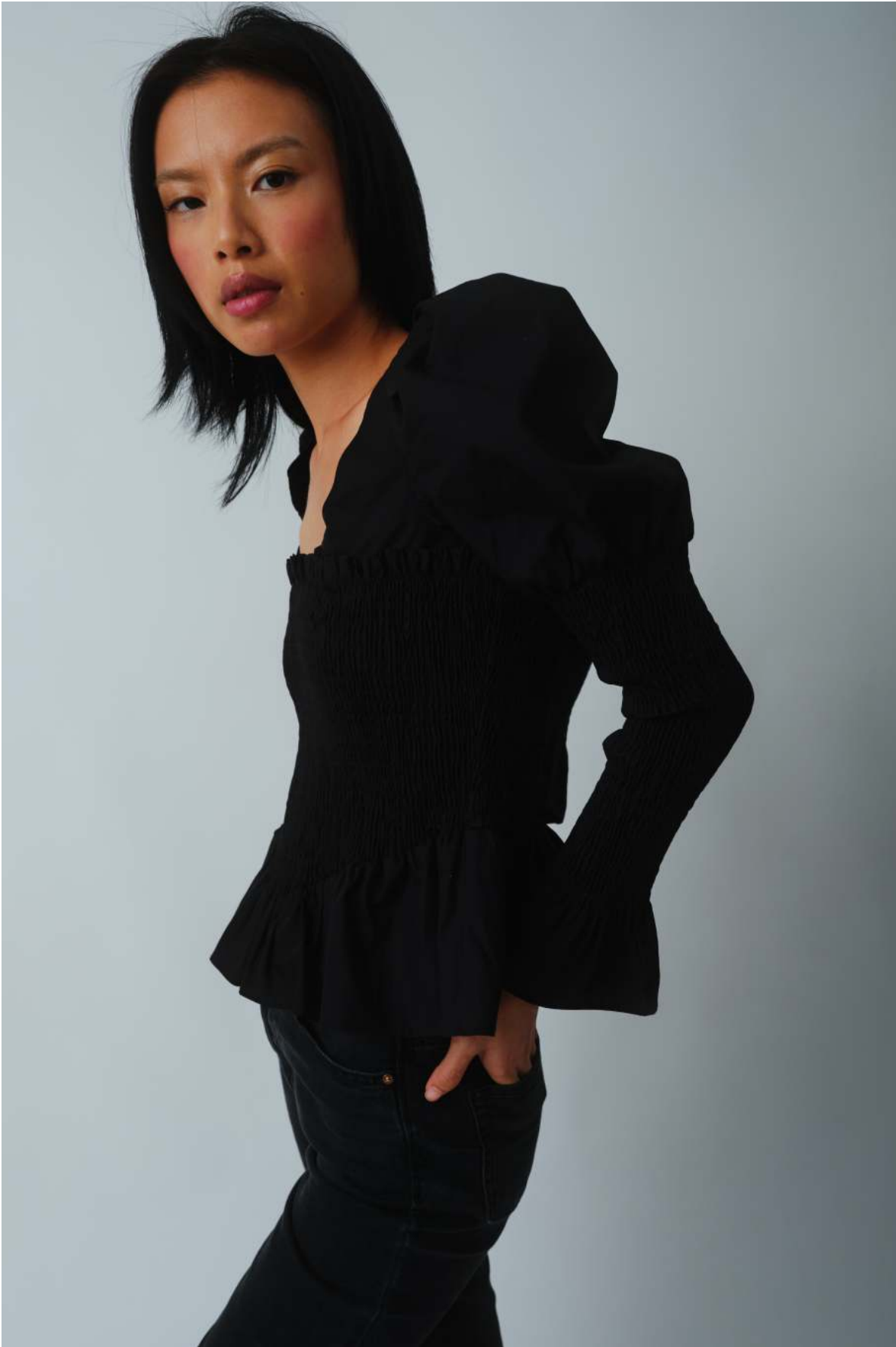
Mira Top in onyx