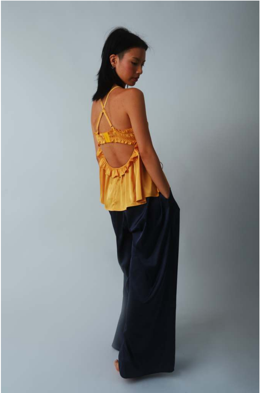
satin bee jacquard lounge pants with elastic waistband