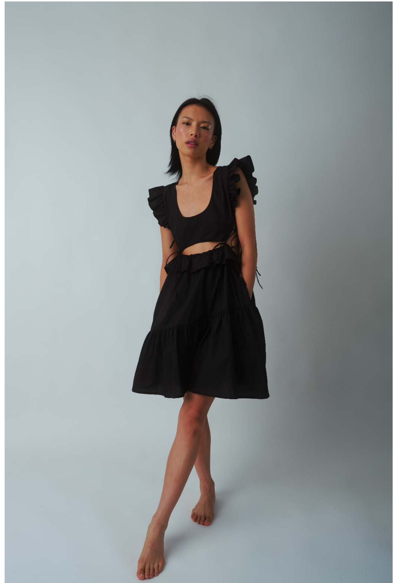
cotton dress with sleeve ruffles and suspension details