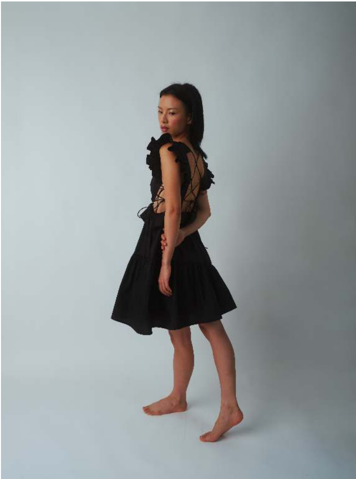
Degas Dress in onyx