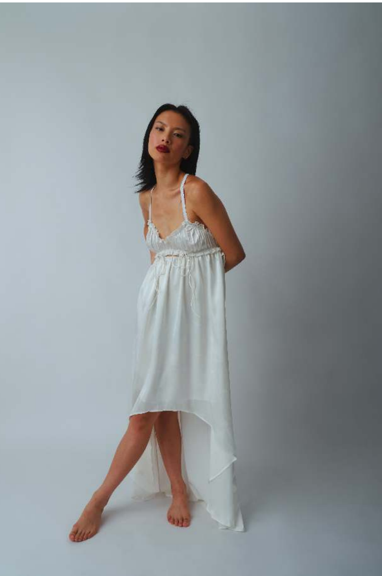
Lettuce Dress in milk