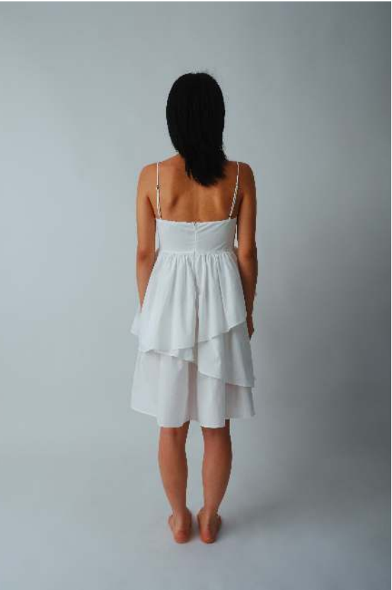
empire waisted cotton dress with adjustable spaghetti straps scallop trim, and asymmetrical skirt