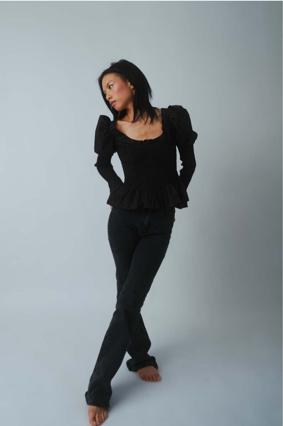
smocked top with puffed sleeves and back neck tie