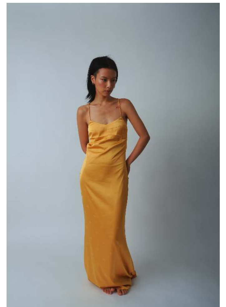
satin bee jacquard slip dress with bodice seam details & lace up back