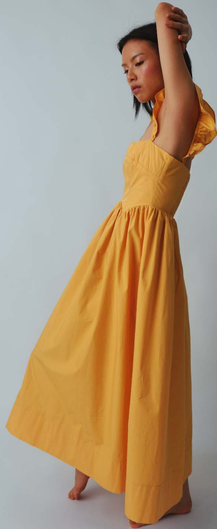
Chai Dress in yolk

cotton dress with side seam pockets, elastic bust bandeau detail, wide bendback hem, and smocking at back