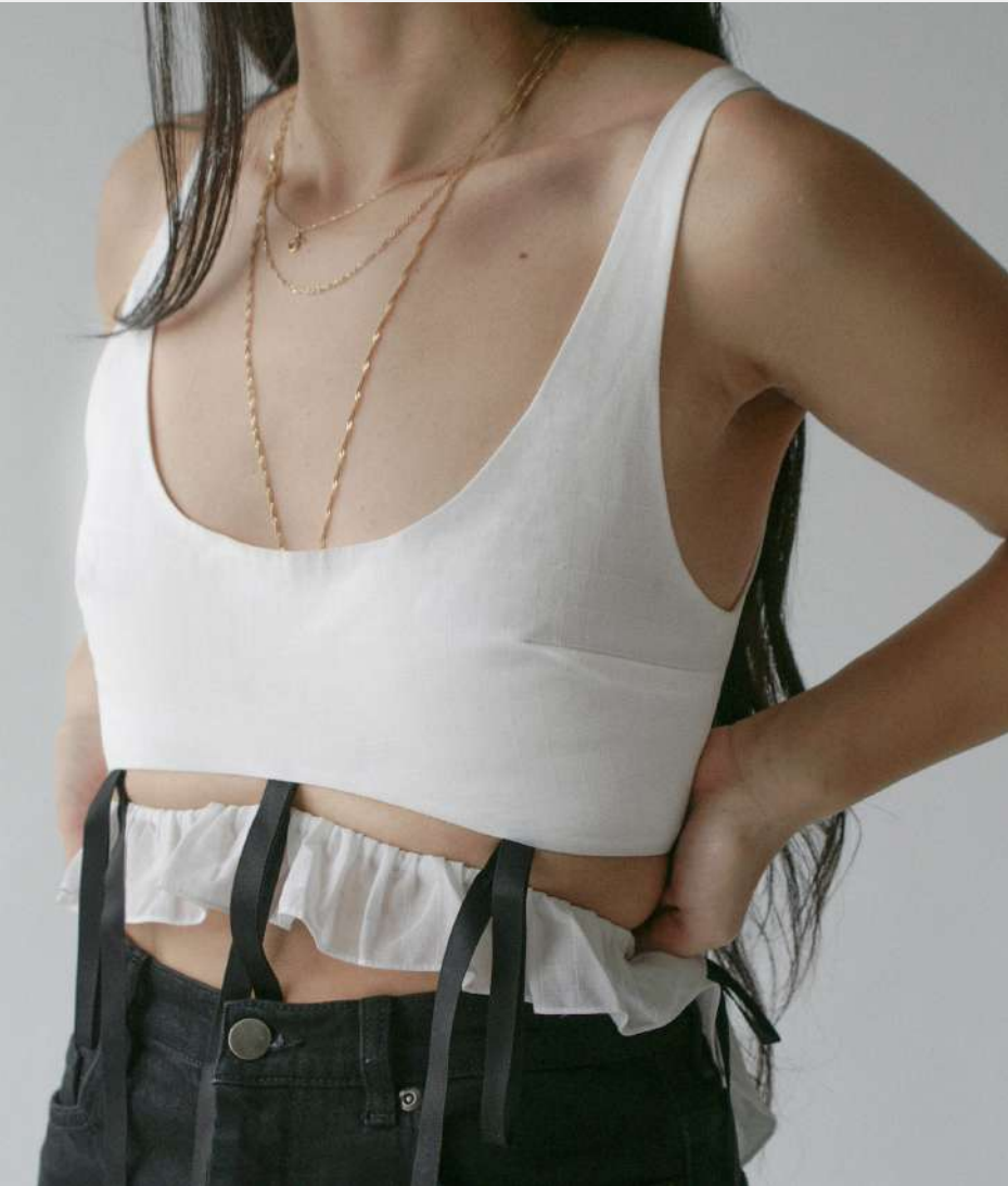
Mei Top pictured in the color milk

cotton top with bows and floating ruffle detail