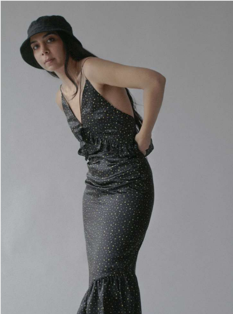
satin dress with asymmetrical ruffle hem and strap detailing at bodice