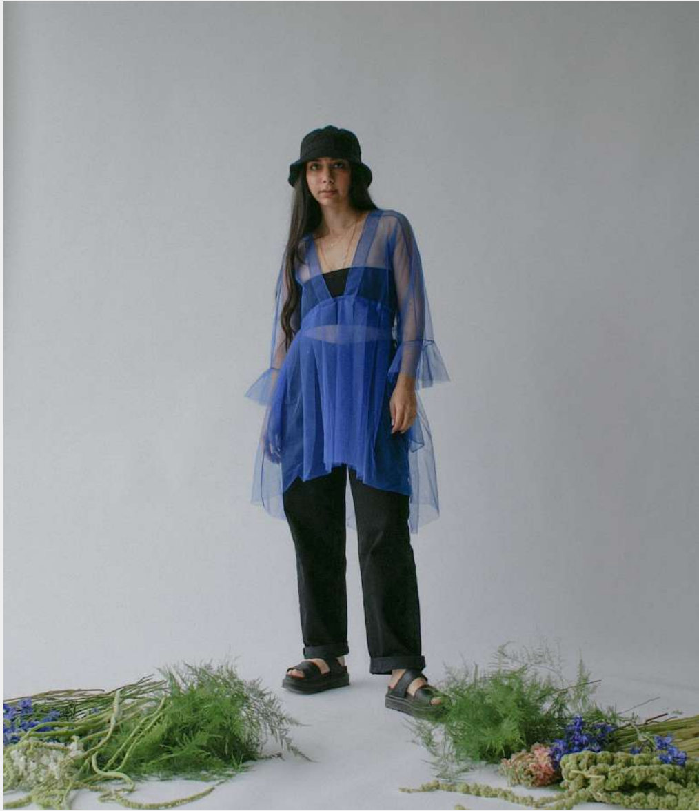
pictured in the color cobalt