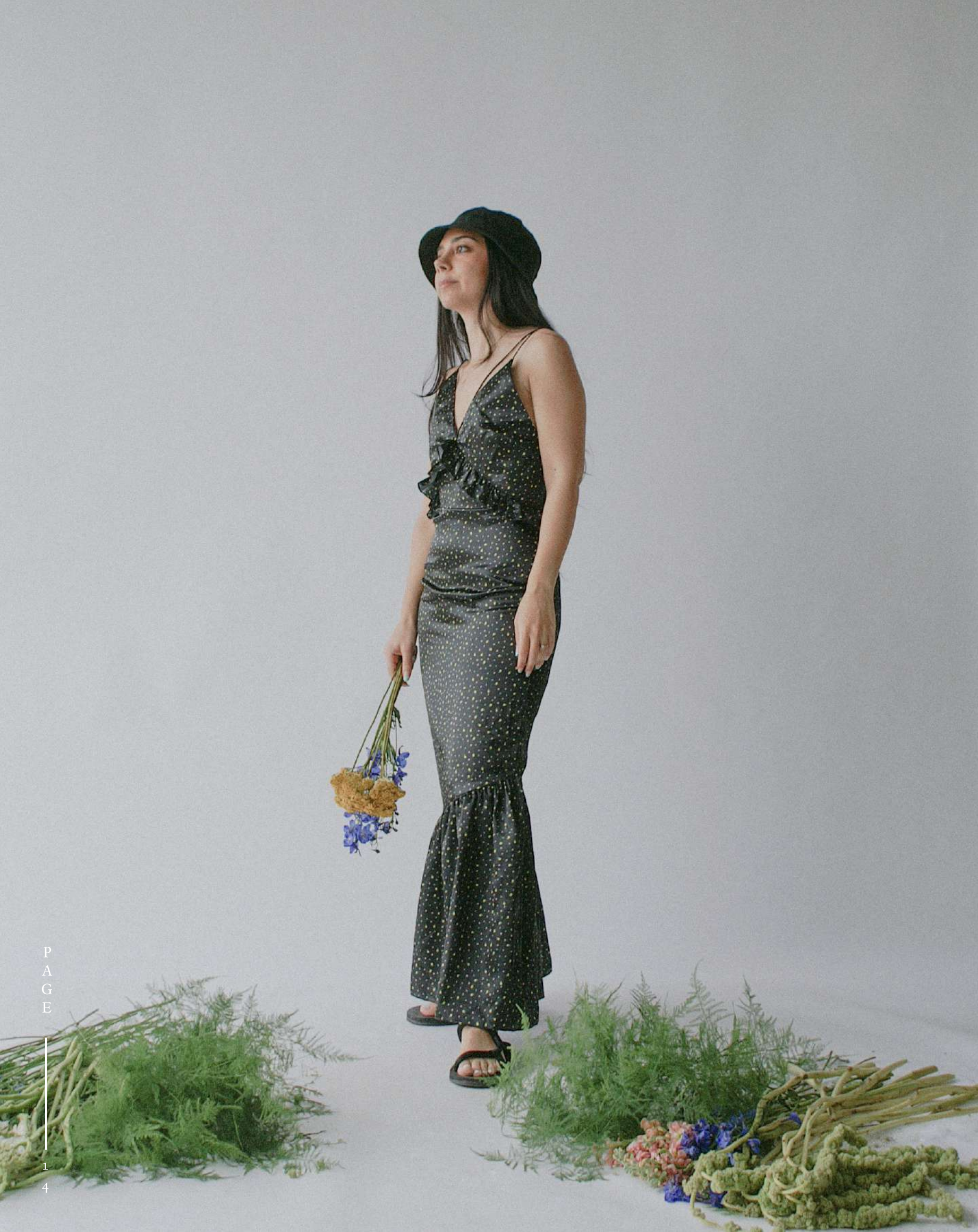
Buddy Dress pictured in the color black bouquet