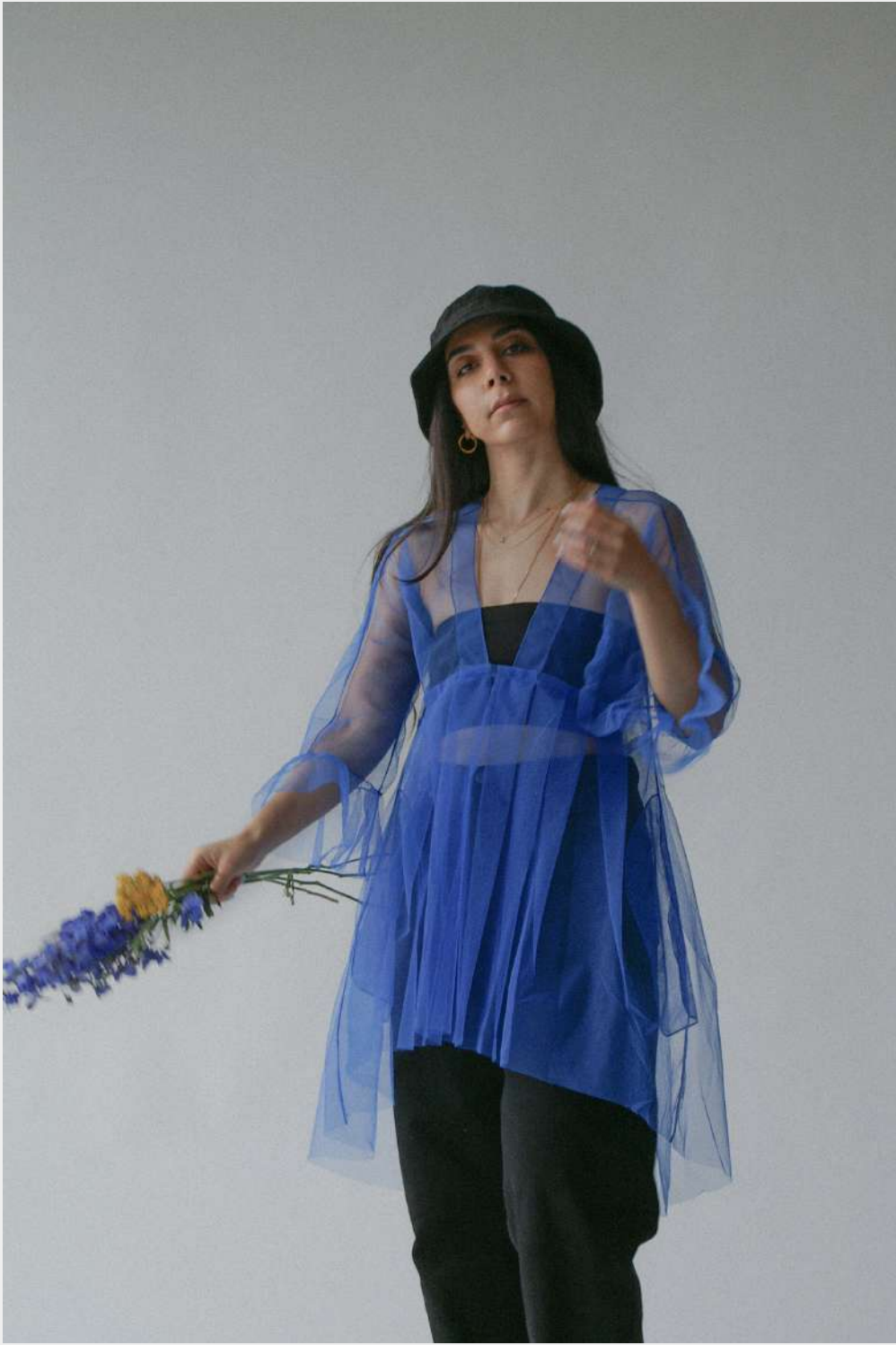
sheer tulle overlay dress with pleating and sleeve ruffles