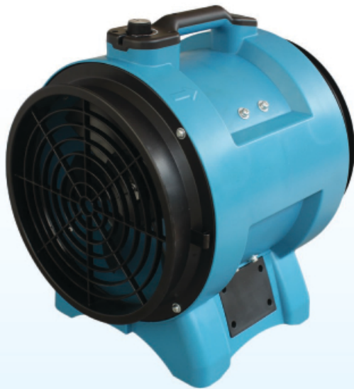
X-8 8" DIAMETER AIR OUTLET

Introducing the X-8 and X-12 Confined Space Ventilator Fans! THE ONE and THE ONLY confined space fans that offers a complete control of both air velocity and air volume with a variable speed control switch. These fans can handle any narrow space with their 8" or 12" diameter flex hoses ducting air up to 125 ft. Just like all the XPOWER products, the X-8 and X-12 are super lightweight and compact. Their low amp and powerful, sealed motors can efficiently deliver dry air to ventilate, create negative air pressure or simply to help complete any drying process for a wide variety of construction applications. The X-8 and X-12 can be used without hoses to create high volume air circulation in gyms, hallways and other large areas. With its ducting hose, the X-8 and X-12 are the perfect fans to deliver a continuous flow of fresh air to subterranean manholes and sewers.