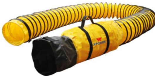
8DH25 / 12DH25 8" Ø x 25 FT. LONG DUCT HOSE / 12" Ø x 25 FT. LONG DUCT HOSE