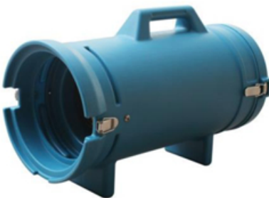
8DHC DUCTING HOSE CARRIER FOR 8DH25