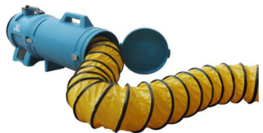
X-8 with 8DHC & 8DH25