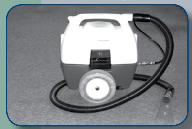
Mini Cart Presto offers two