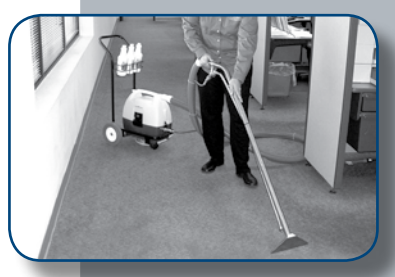
Standard Cart and Optional spotting

Double Dry™ Hand Tool uses an enclosed jet spray to prevent overspray and dual vacuum ports for superior water recovery. Features a built-in brush for more aggressive cleaning.