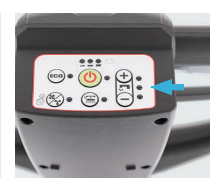
8. Press the + or – buttons to increase / decrease the solution flow rate.