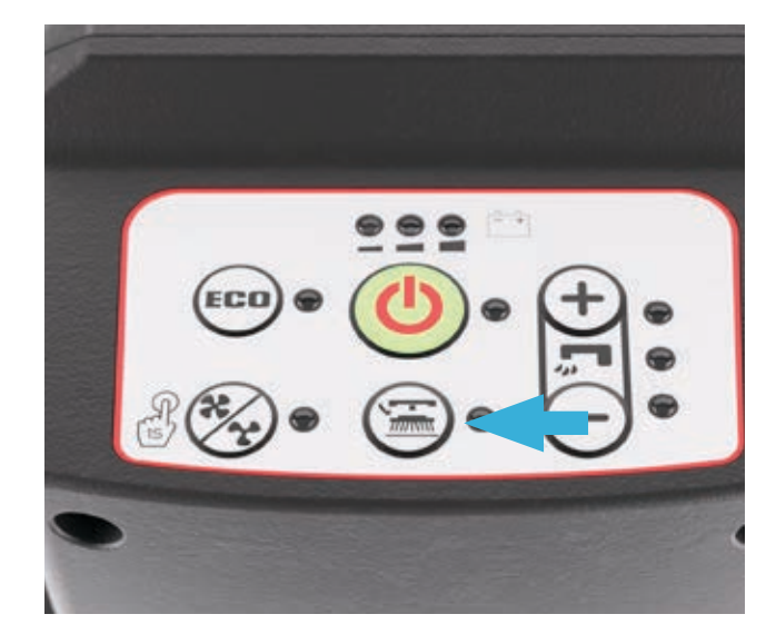
15. Daily: With the machine turned on and the deck lifted, press the click off button to release the brush/ pad holder then clean and inspect before next use.