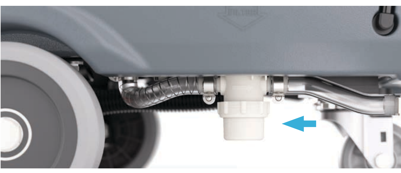
16. Weekly: Inspect the solution filter and clean if required.