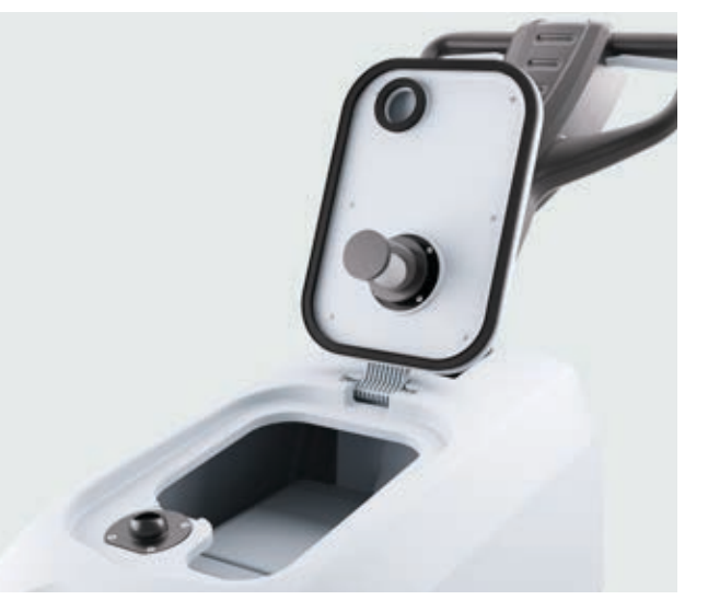
17. Daily: Leave the recovery tank lid open to let the tank dry after it's been cleaned to avoid odor.