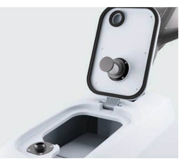
13. Daily: Inspect and rinse the float ball cage and inspect and clean the lid gasket if required.