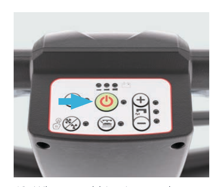
10. When scrubbing is complete, turn off the machine to perform the following maintenance.