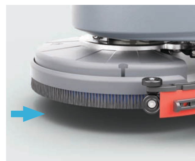
3. Place the brush or pad holder under the deck and lower the deck onto the brush or pad holder by pressing the pedal.