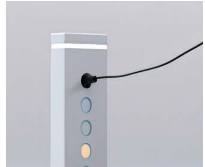
18. Daily: Charge the batteries: Connect the battery charger cable to the electrical socket. Light turns red when charging and green when the charging is complete.

If the machine has been used until the Red light illuminates on the battery level indicator on the machine, a full recharge of the batteries (10-12 hours) will be required. Failure to carry out this this procedure may cause damage to the batteries. Charging the batteries after every use is recommended.