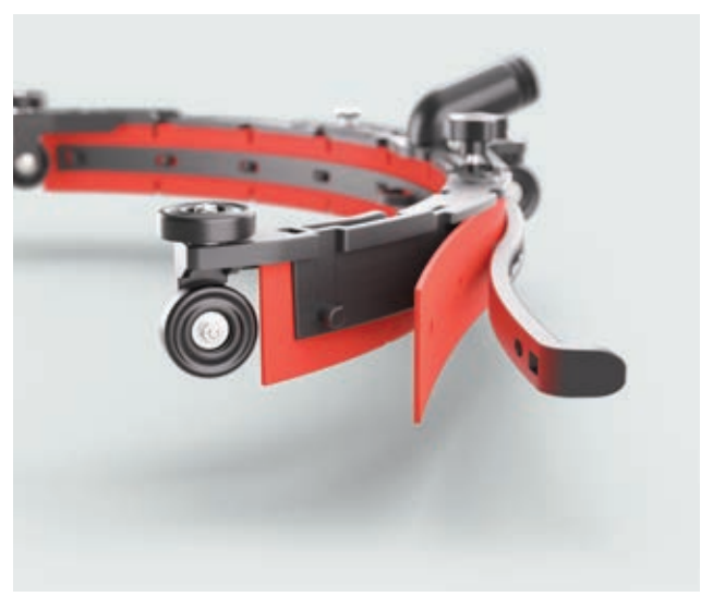
14. Daily: Remove the squeegee, and clean. Inspect the blades and flip them or replace them if required.