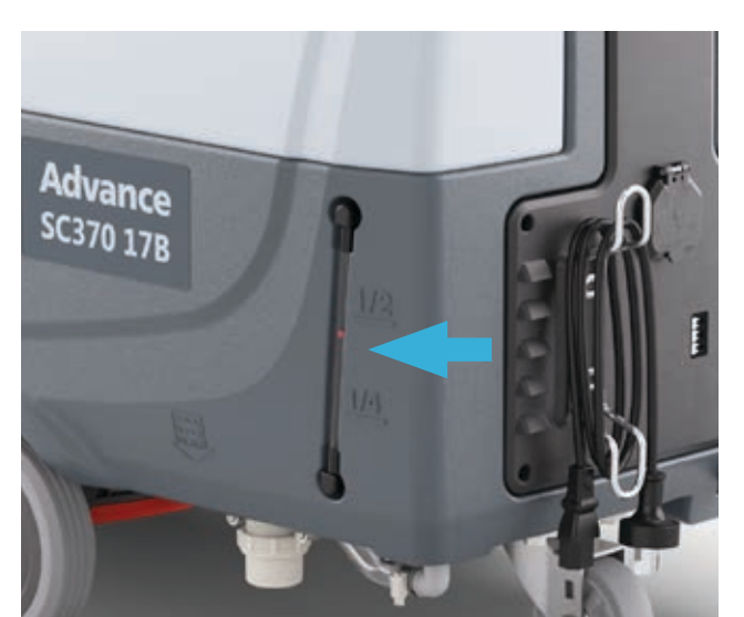
6. Check the solution level with the red ball on the left side of the machine.