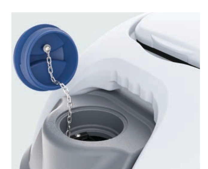
5. Remove the blue cover, fill the tank with clean water not exceeding 40°C / 104°F. Add appropriate low foaming detergent according to dosage information.