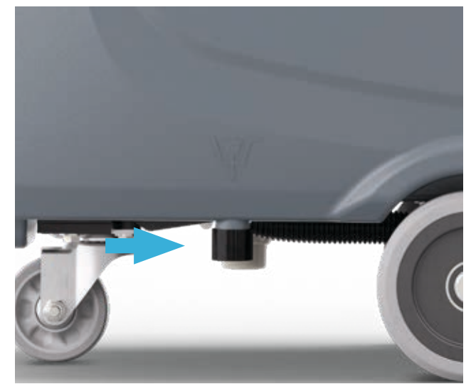
11. Daily: Empty the clean water tank using the solution tank drain knob under the machine.