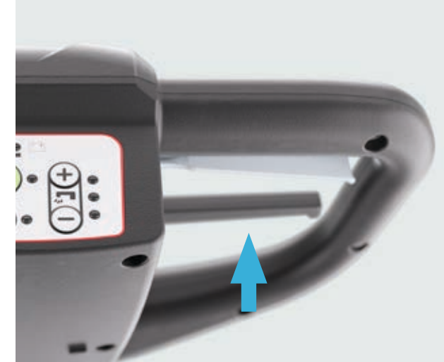
7. Adjust handle to fit operators' height and then start cleaning by placing hands on the safety switches.