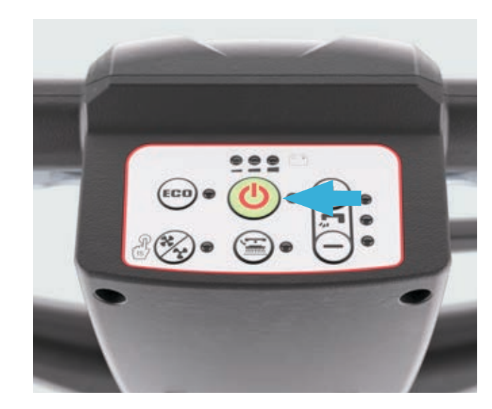
Turn on the machine and verify there is enough battery power to complete the work. Charge batteries if required.

ATTENTION! Do not use the machine before you have read and understood the User Manual