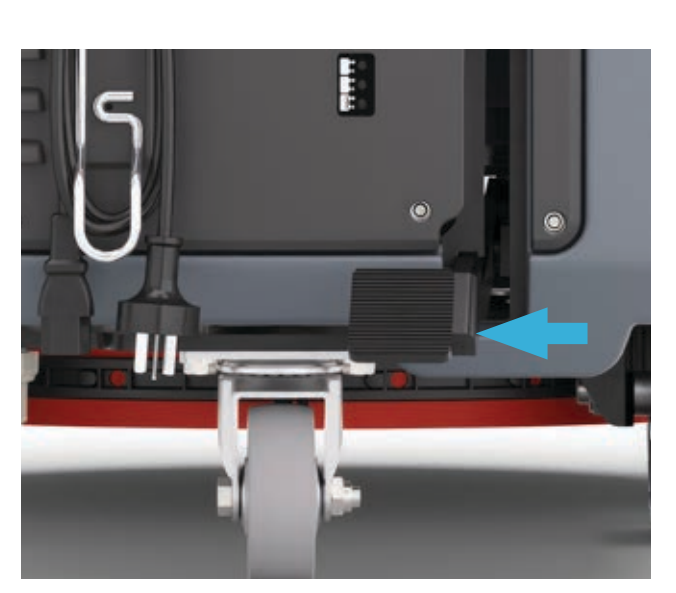
2. Lift the deck by pressing the pedal.