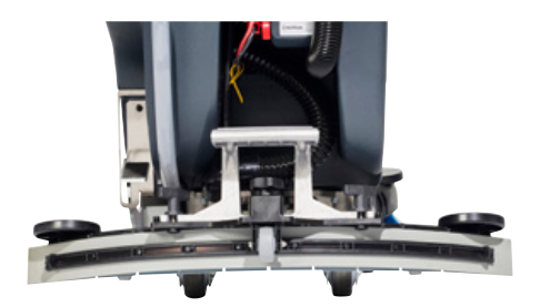
Patented squeegee blade system makes maintenance fast and simple through blade flipping – four wear edges.