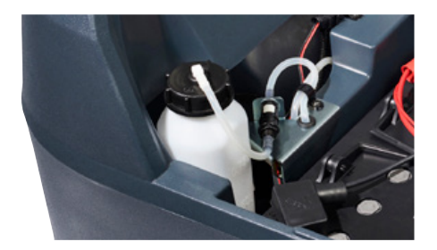
Optional detergent mixing system (allows for flexible detergent setting or water only cleaning).

Hospitals and Healthcare Facilities Grocery Stores Restaurants Convenience Stores Restaurants Retail Outlets