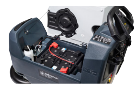
SilentTech<sup>TM</sup> sound insulated vacuum motor delivers 60 \pm 3 dB(A) in Quiet Mode for noise sensitive environments.