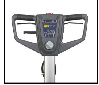
Get familiar with the control panel.