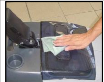
Wipe exterior of machine with a damp cloth.