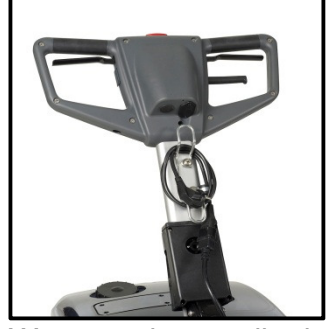
Wrap cord accordingly.