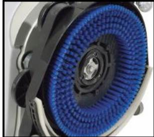
Remove, clean and inspect brush or pad. Rinse with warm water. Hang to dry. Replace if needed.