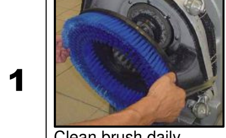
Clean brush daily.