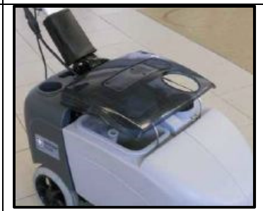
Lift recover tank lid to allow inside of the tank to dry.