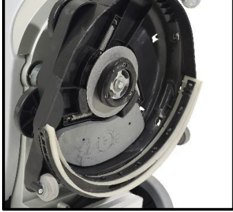
Brush deck rubber pad check and/or replacement