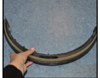
Inspect squeegee, rinse and replace if needed.