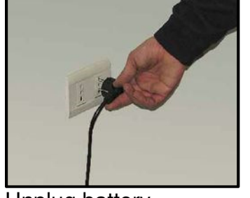
Unplug battery charger.