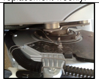
Brush deck end-ofstroke cable check and/or replacement yearly.