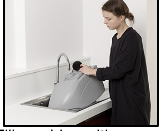
Fill machine with appropriate solution (temperature should not exceed 130 °F).