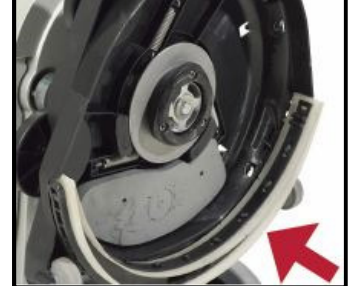
Take squeegee off and remove debris.