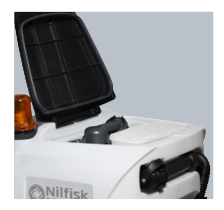
Fully removable recovery-tank lid for easy cleaning