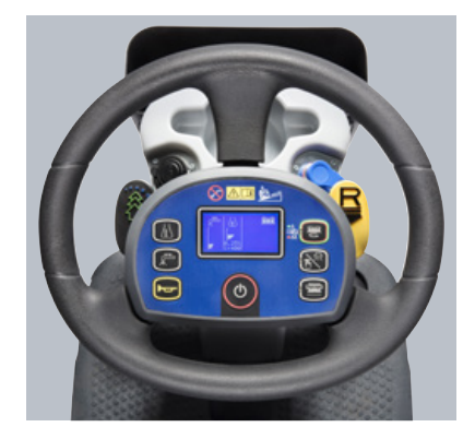
Intuitive dashboard with One-Touch button and built-in LCD display