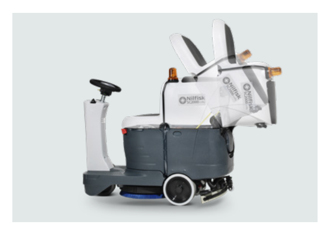
Full-tilt recovery tank provides easy access to battery compartment and Ecoflex system