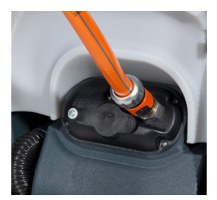
Filling system with automatic shut-off once tank is full (optional)