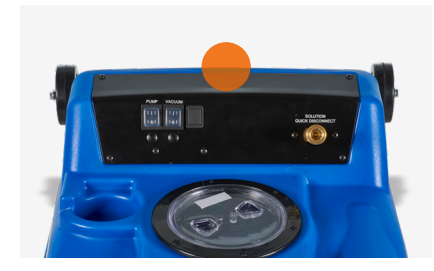
SIMPLE OPERATION Simple to use and understand controls, all user-facing and conveniently placed