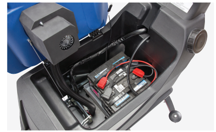
EASY ACCESS TO MOTOR, BATTERIES AND TANKS