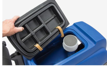
RECOVERY TANK FILTER