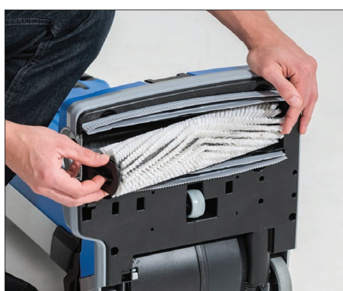
16. Remove the cylindrical brush by turning the side knob clockwise.