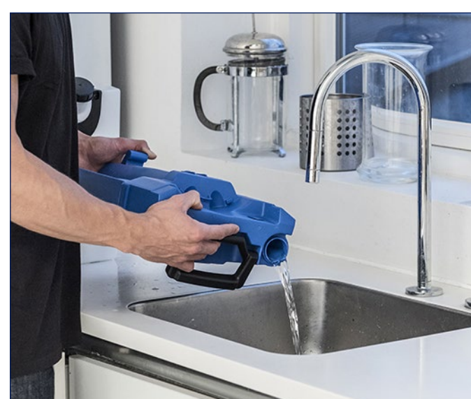
14. Empty the recovery and solution tank. Clean them with water.