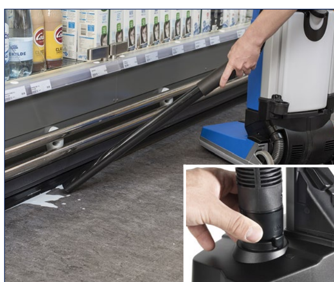
11. To use the manual suction hose, press the power switch to start the machine in upright position. Turn the hose connection to ON and use the suction tube. When done, turn hose connection to OFF. (**)