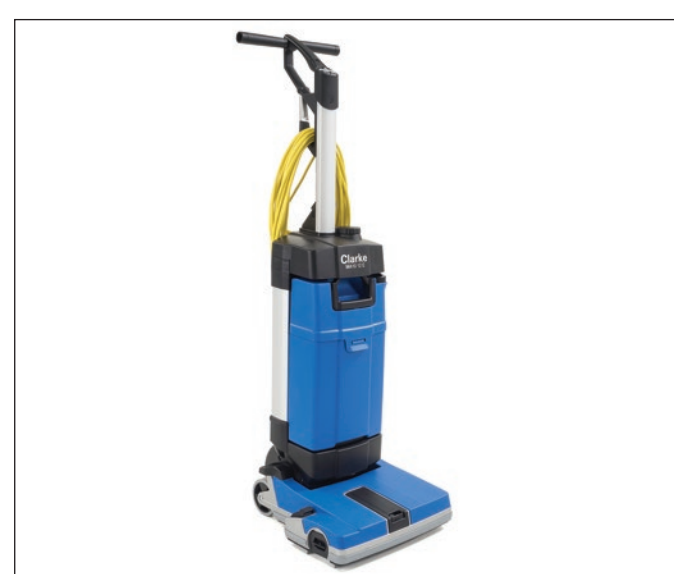
19. Wipe down the machine using a damp cloth, and where needed use a neutral cleaning product. Then store the machine in a clean and dry place.

(*) ALWAYS FOLLOW THE DETERGENT DOSING RECOMMENDATION ON THE LABEL OF THE CHEMICAL PRODUCT USED.