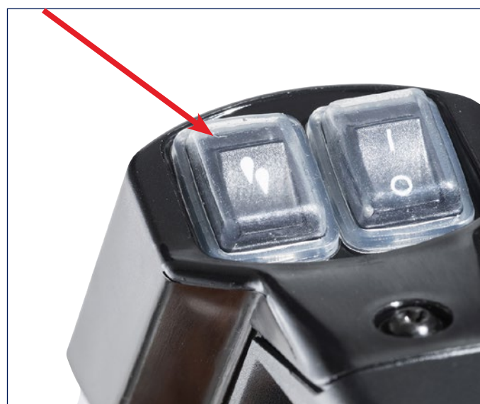
8. Press the solution switch to start the solution flow.