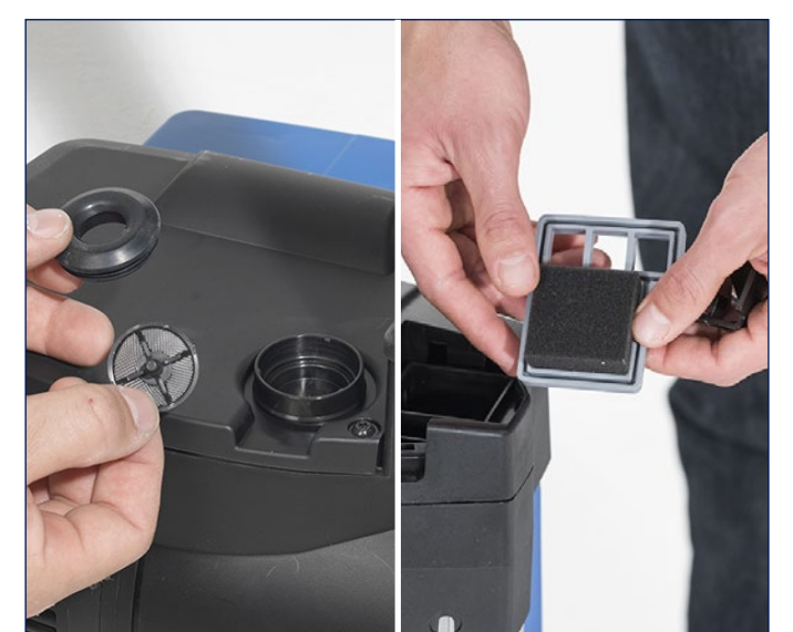
15. Check and clean the solution and vacuum filter regularly.