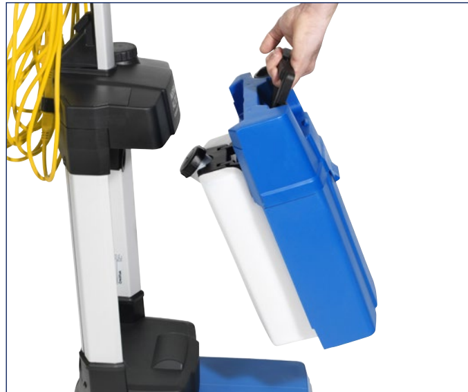
1. Release the handle to remove the tank assembly.

ATTENTION! Do not use the machine before you have read and understood the Instructions for Use Manual.