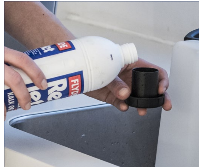
3. The tank cap can be used for dosing the detergent. One full cap is 30 ml giving 1% detergent of the 0.8 gal (3 L) tank capacity. (*)