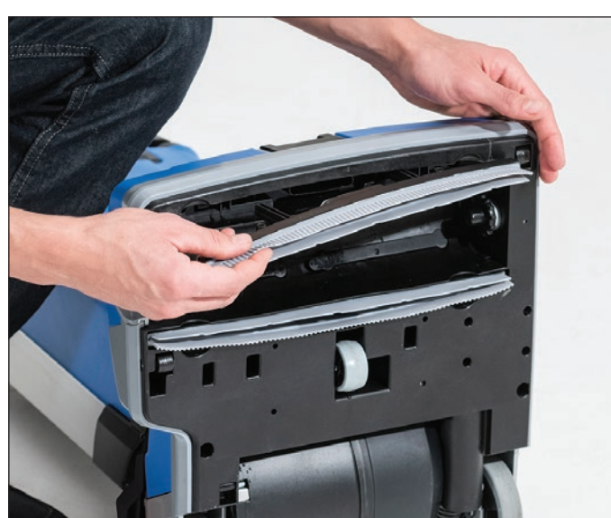
17. Remove the squeegee bars.