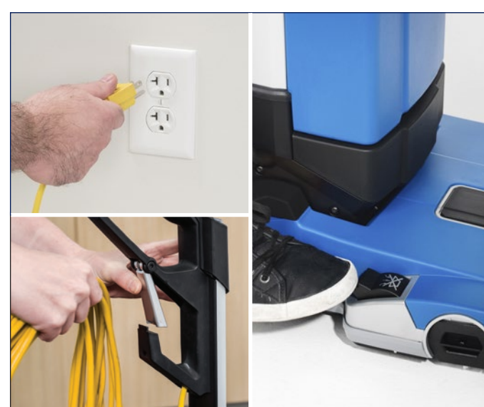
13. Disconnect the power plug from the electrical socket and rewind the cord, starting at the machine, and place it in the cord holder.