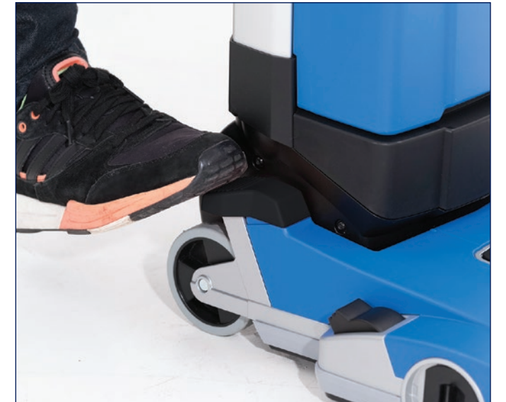
5. Press the black pedal to put the machine in working position.