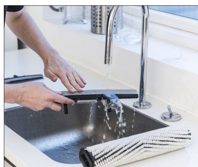
18. Clean the squeegee bars and the cylindrical brush with water. Check for wear and replace when necessary.