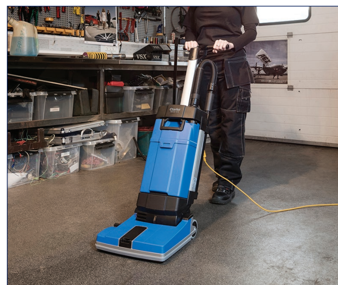
9. Move the machine with the handle and start cleaning the floor.