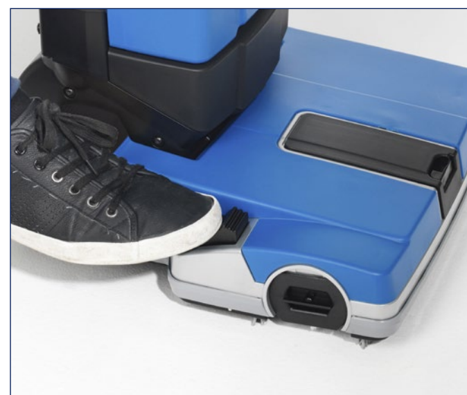
6. For double scrubbing, flip the pedal to lift/lower squeegees.