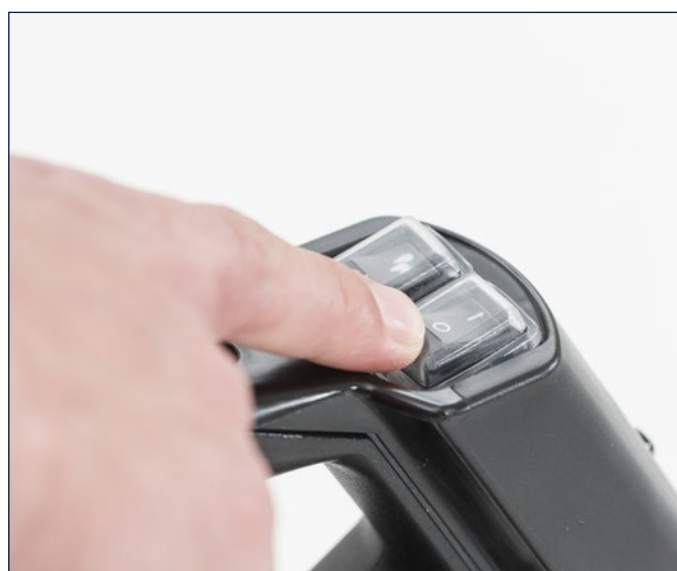
7. Press the start/stop switch to start the machine.