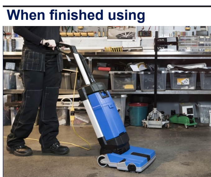
12. Park the machine in the upright position and turn off the power switch.