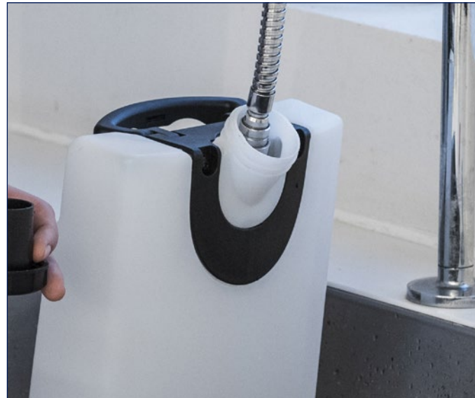
2. Fill the solution tank with clean water, not to exceed 100° F.