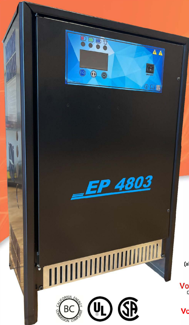
ETP Charging Profile "Wsa-Pulse"